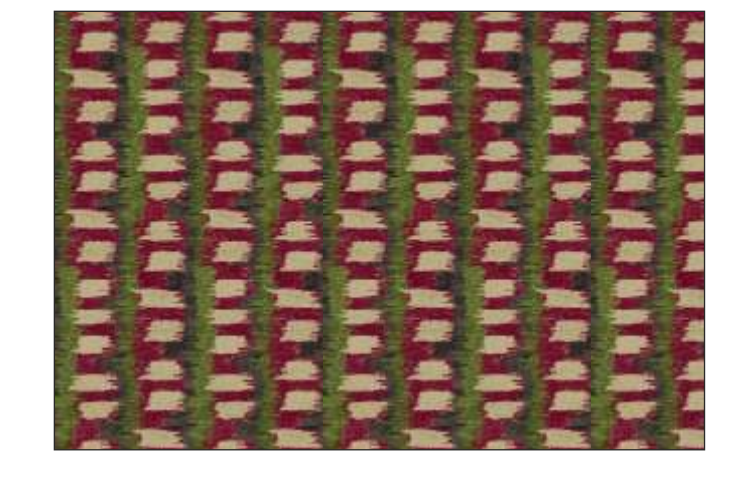
SUMBA 303 SUMBA 403