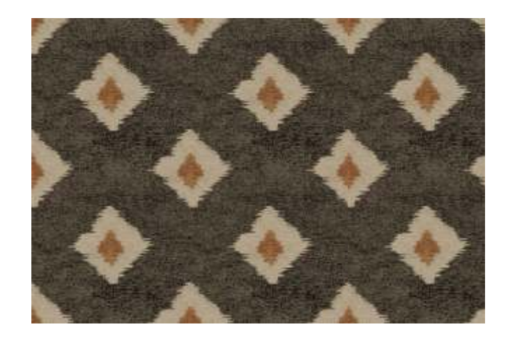
SUMBA 301 SUMBA 401