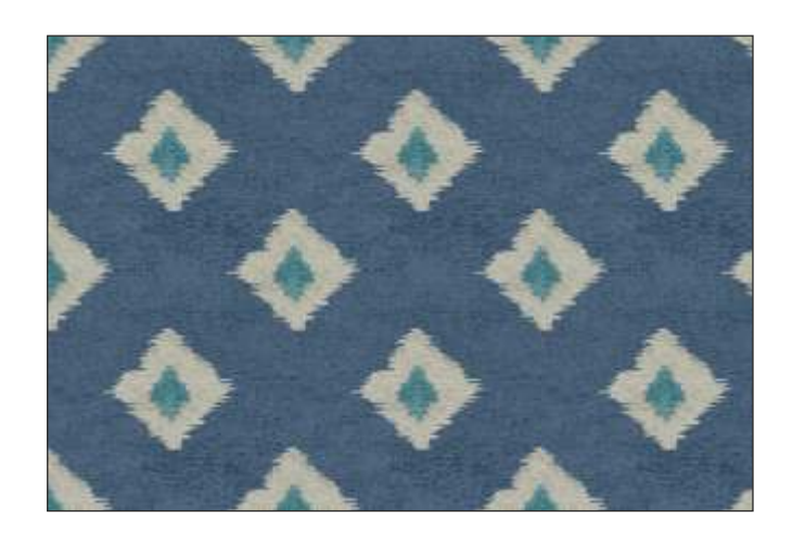
SUMBA 305 SUMBA 405