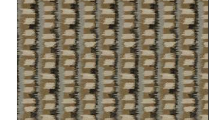
SUMBA 302 SUMBA 402