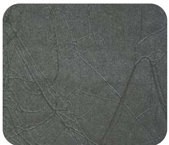
BREZZA - 508