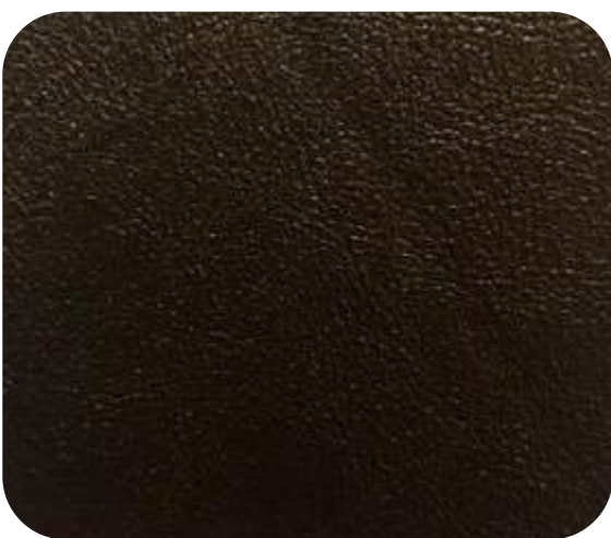
BREZZA - 514