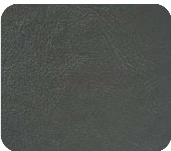
BREZZA - 517