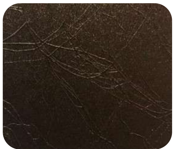
BREZZA - 505