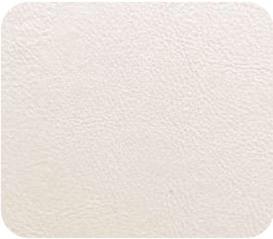
BREZZA - 510