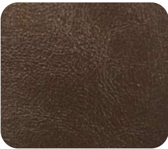
BREZZA - 513