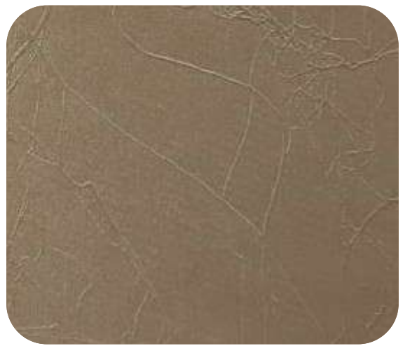
BREZZA - 503