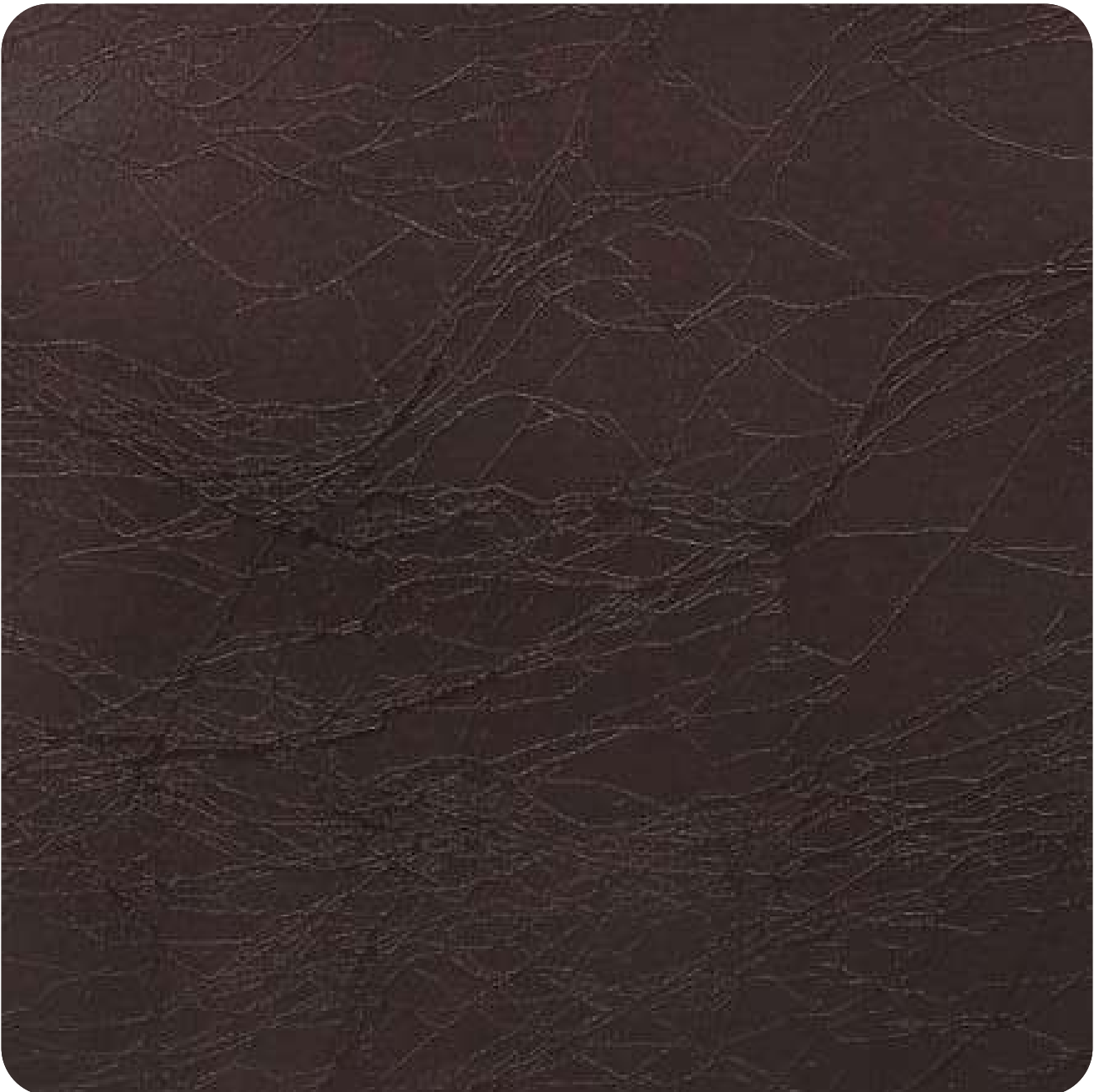
BREZZA - 506