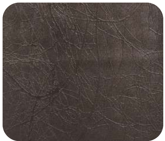
BREZZA - 507