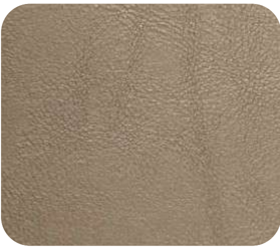
BREZZA - 512