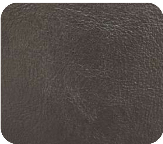
BREZZA - 516