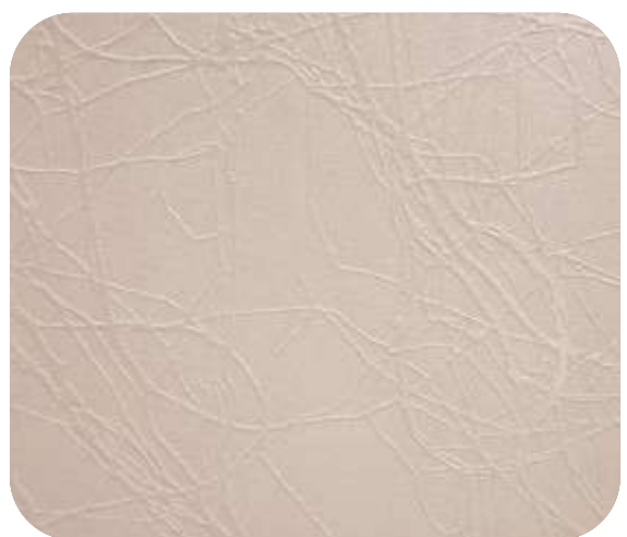
BREZZA - 502