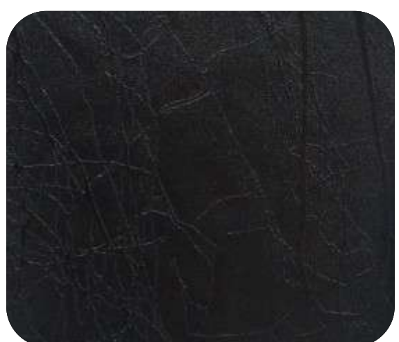
BREZZA - 509