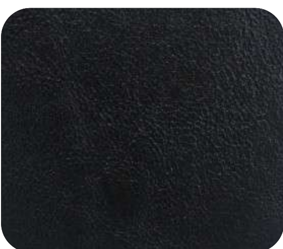
BREZZA - 518