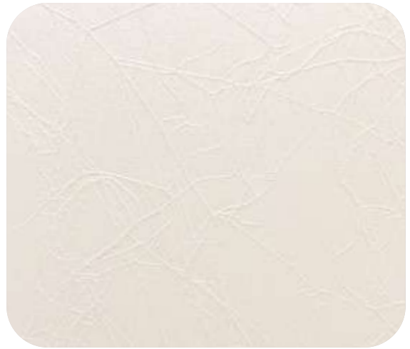
BREZZA - 501