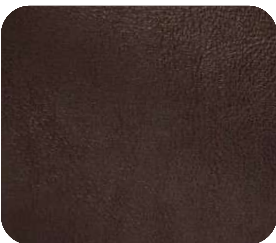
BREZZA - 515