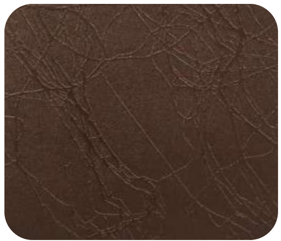
BREZZA - 504