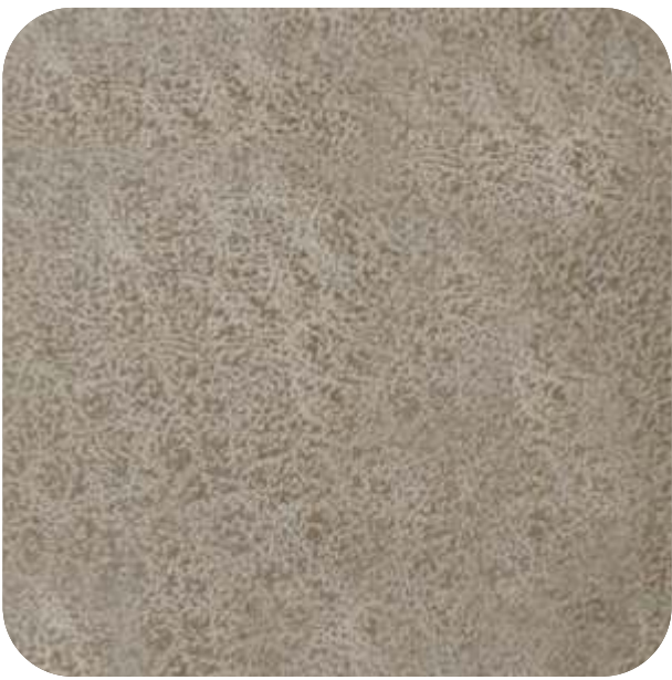
BERLIN - 901