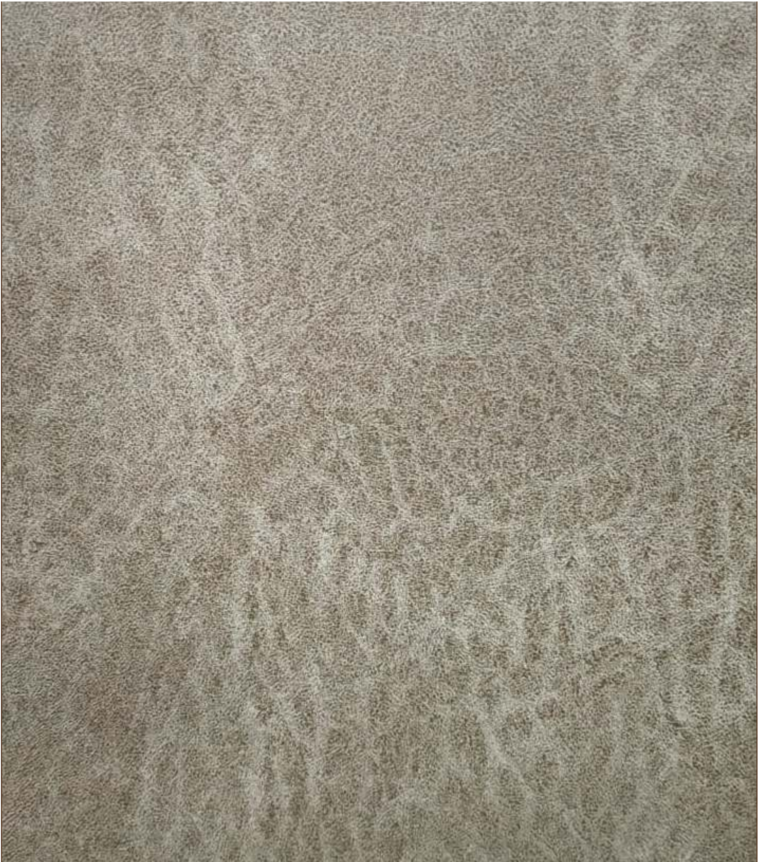
BERLIN - 903