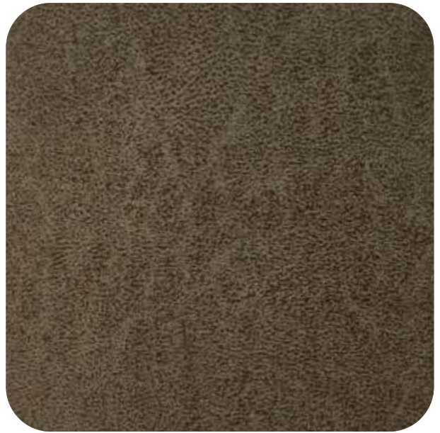
BERLIN - 904