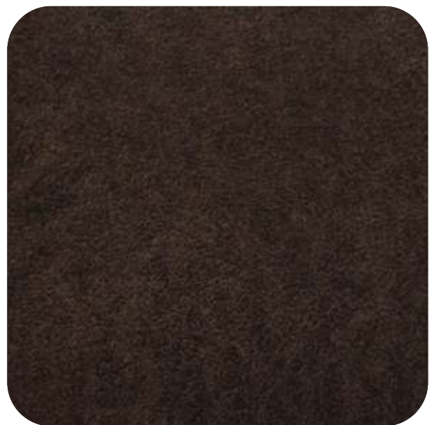
BERLIN - 908