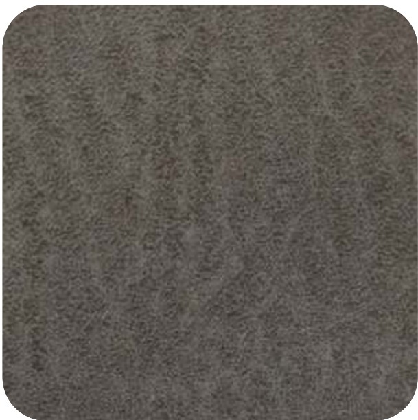
BERLIN - 911