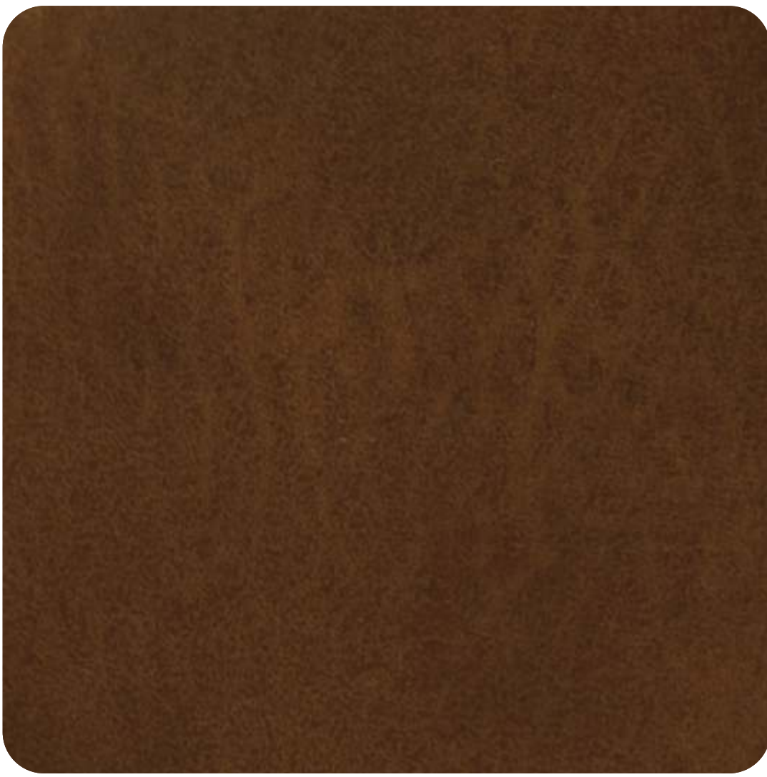
BERLIN - 906