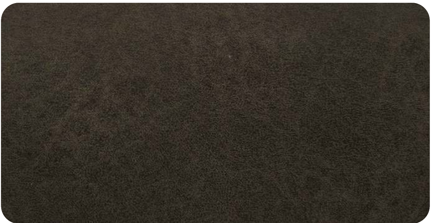
BERLIN - 910