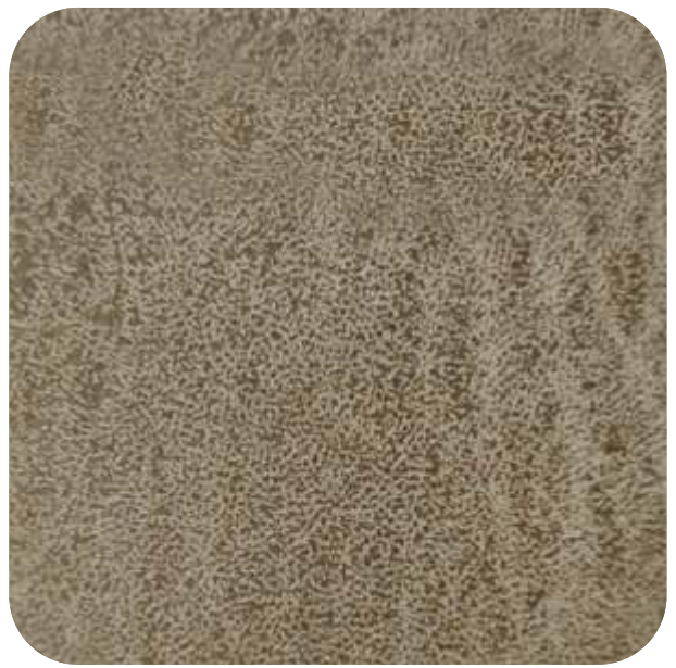
BERLIN - 903