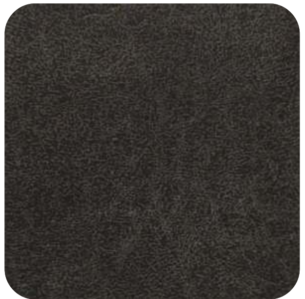
BERLIN - 912