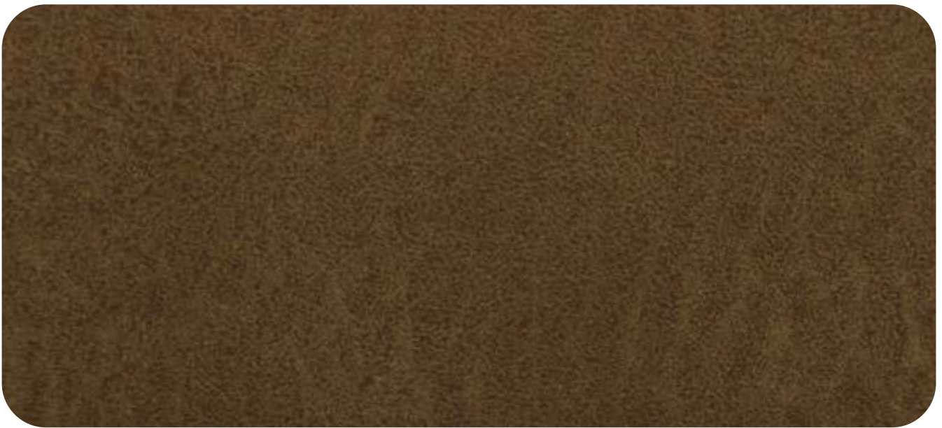
BERLIN - 905