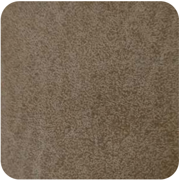
BERLIN - 902