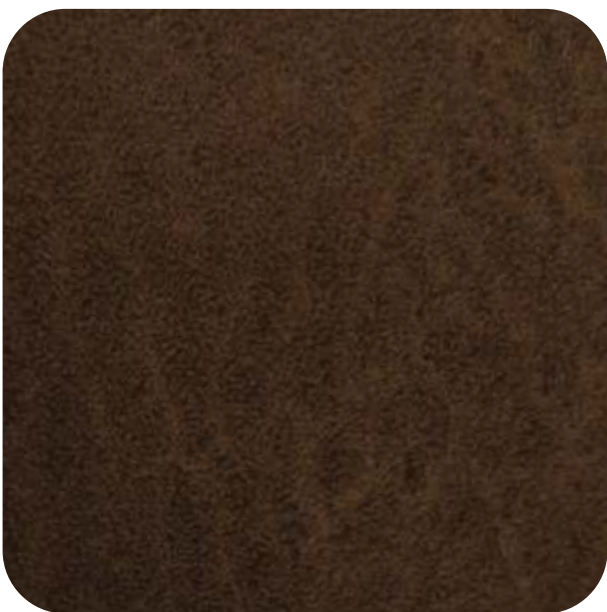
BERLIN - 907