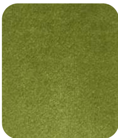
ADRIANA - 909