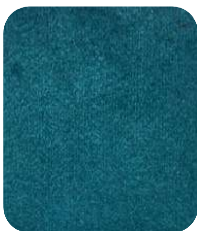
ADRIANA - 921