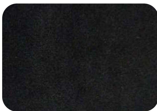
ADRIANA - 927