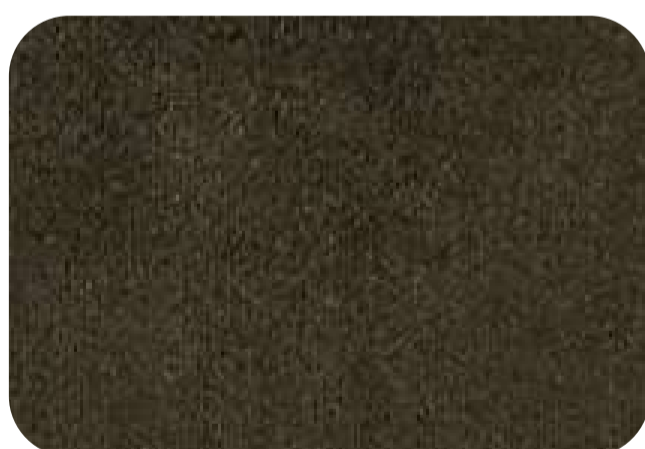
ADRIANA - 906