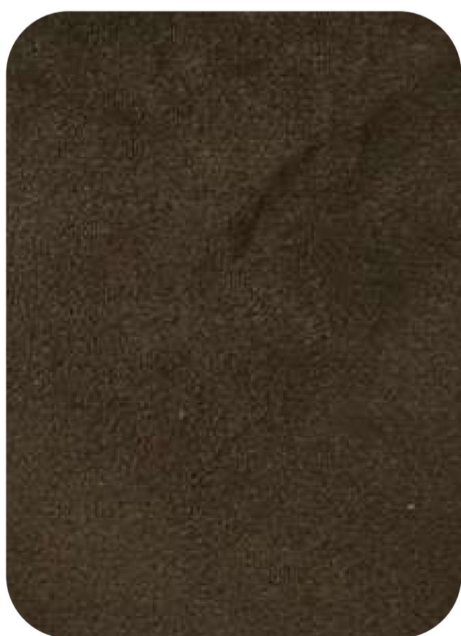
ADRIANA - 907