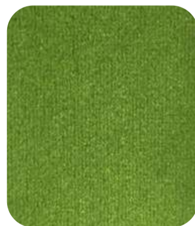
ADRIANA - 910