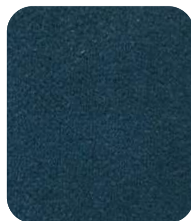
ADRIANA - 922