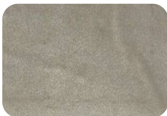
ADRIANA - 923