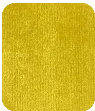
ADRIANA - 911