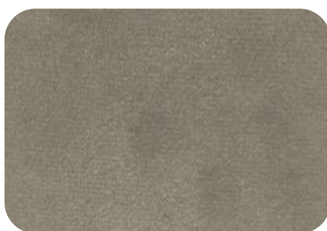
ADRIANA - 925