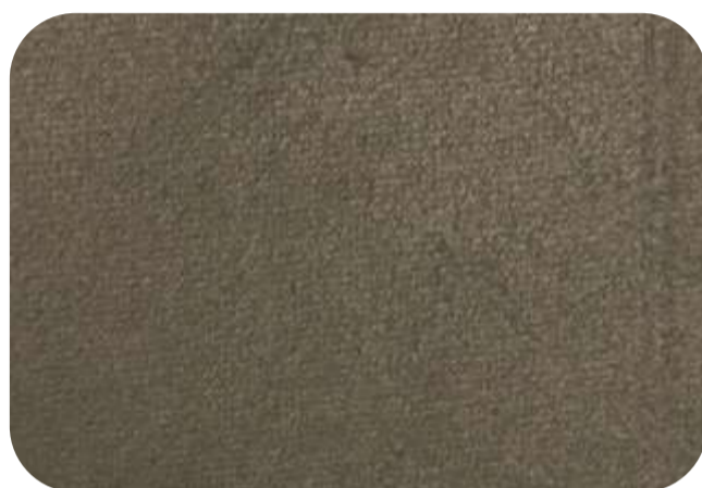
ADRIANA - 905