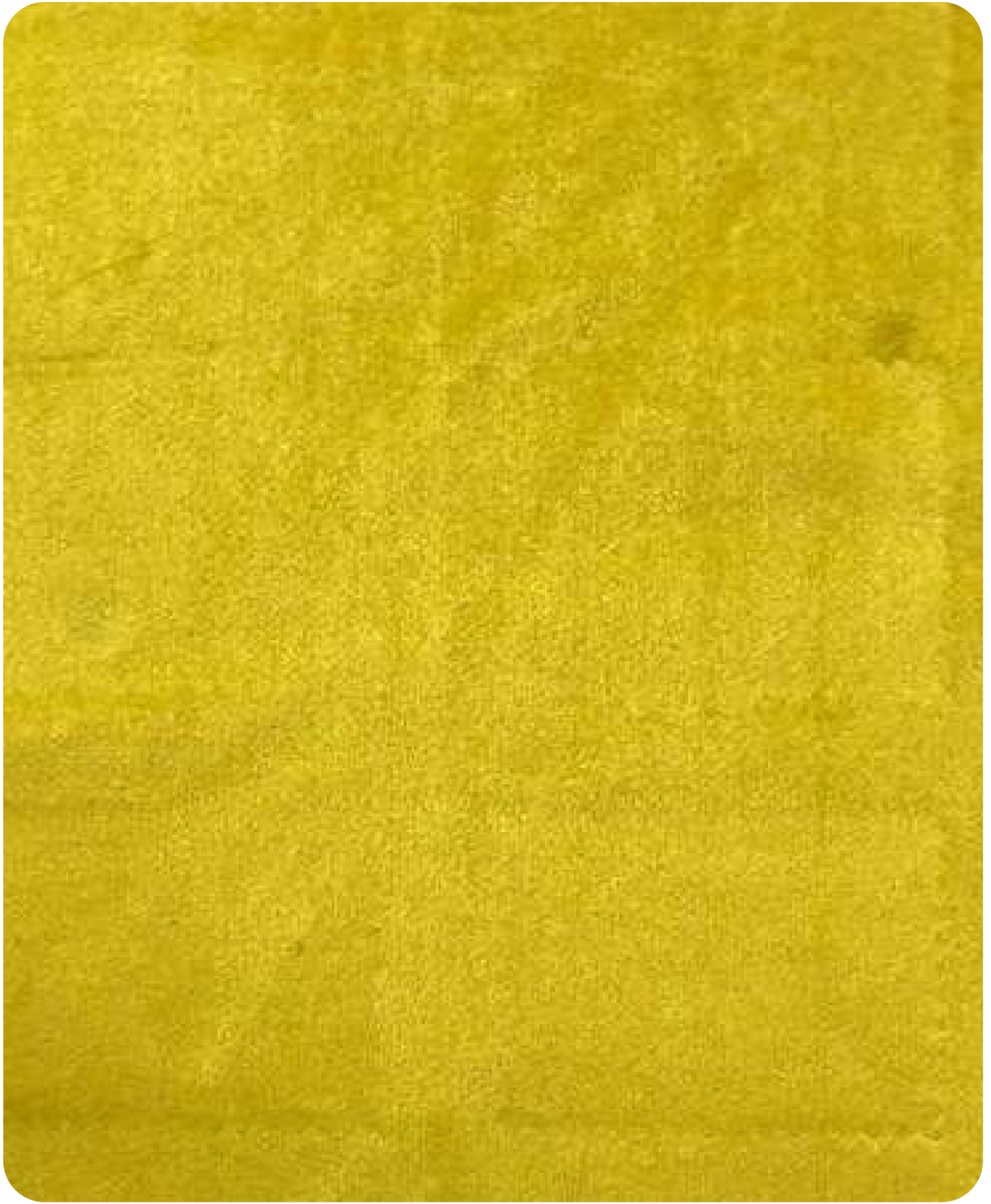
ADRIANA - 911