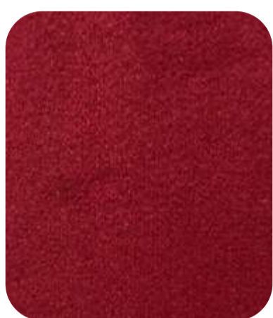
ADRIANA - 913