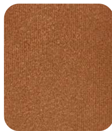
ADRIANA - 912