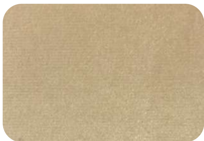
ADRIANA - 902