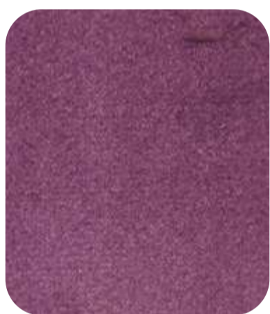
ADRIANA - 916