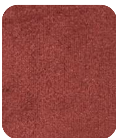
ADRIANA - 914