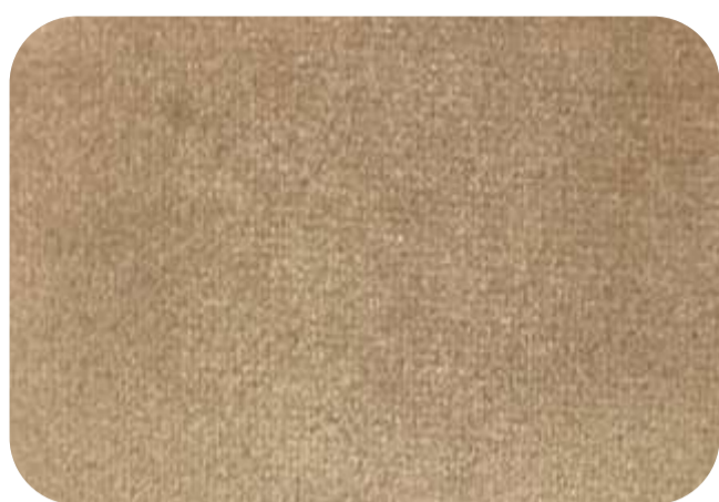
ADRIANA - 903