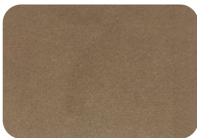
ADRIANA - 904