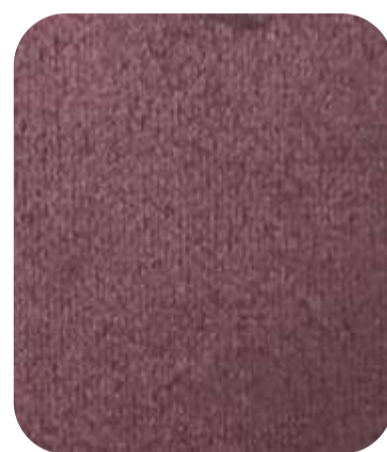
ADRIANA - 917