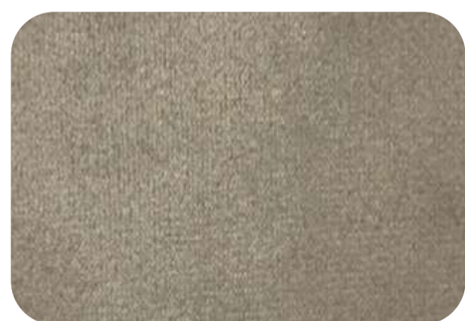
ADRIANA - 924