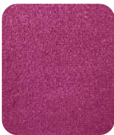
ADRIANA - 915