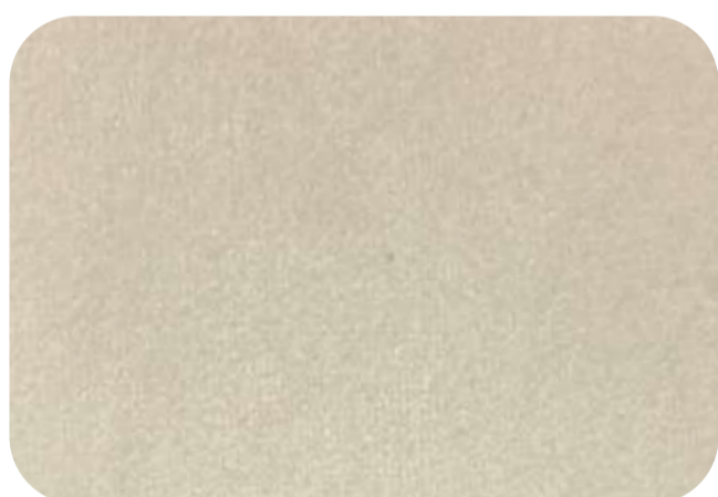
ADRIANA - 901