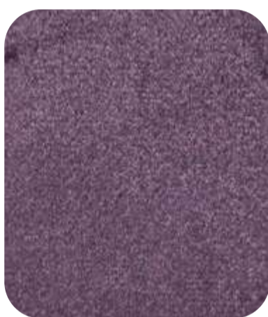
ADRIANA - 918