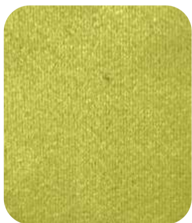
ADRIANA - 908