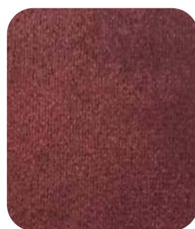
ADRIANA - 919