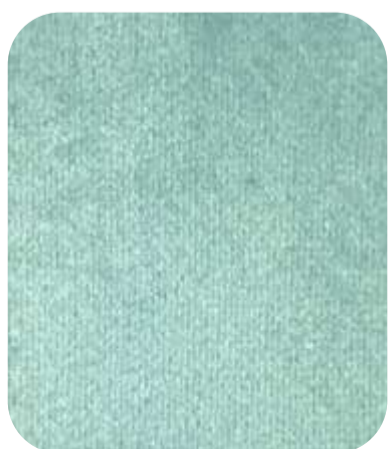
ADRIANA - 920