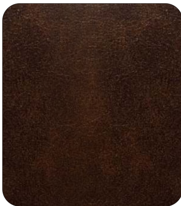
VINTAGE - 706