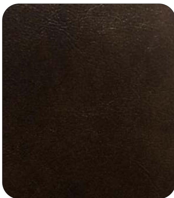
VINTAGE - 707