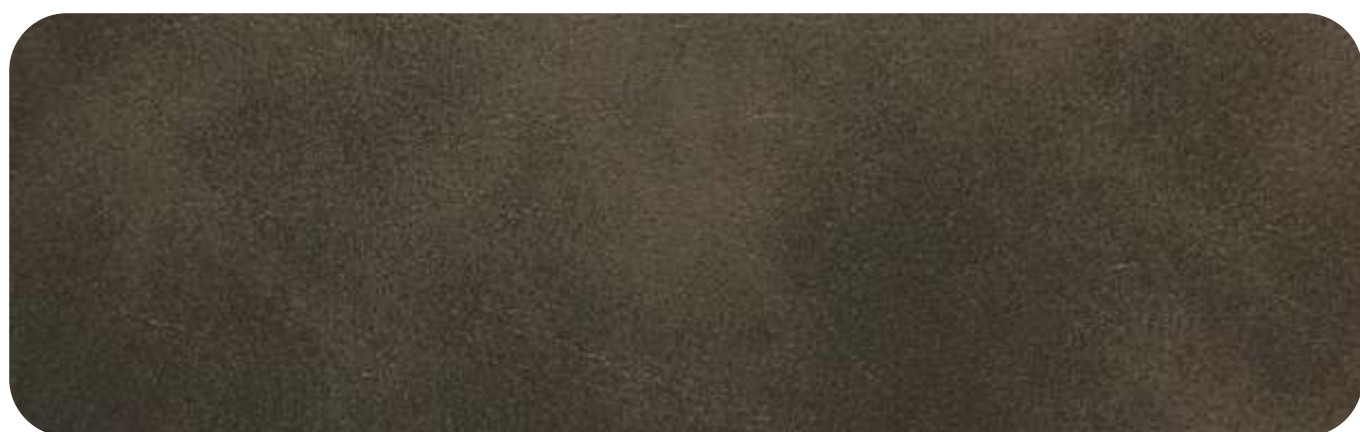
VINTAGE - 709