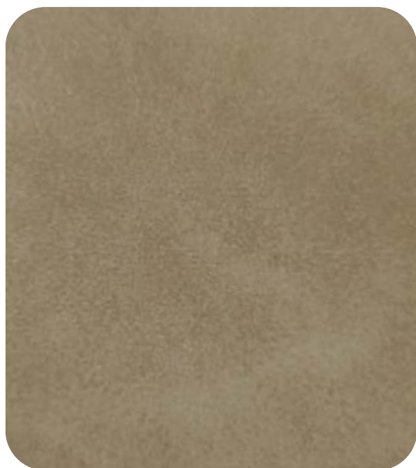
VINTAGE - 702