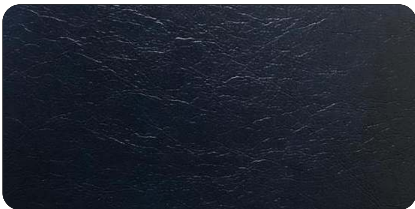
VINTAGE - 712