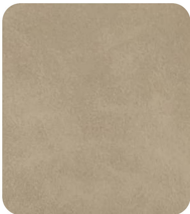
VINTAGE - 701