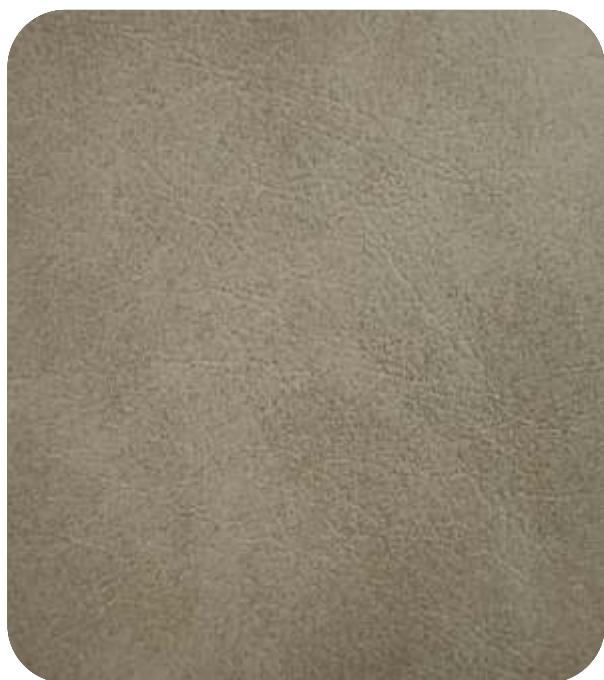
VINTAGE - 703