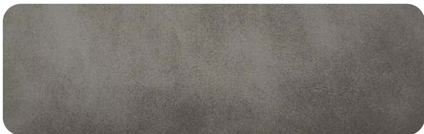
VINTAGE - 710