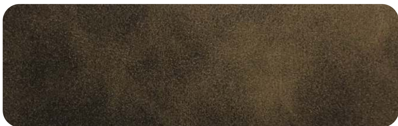
VINTAGE - 708