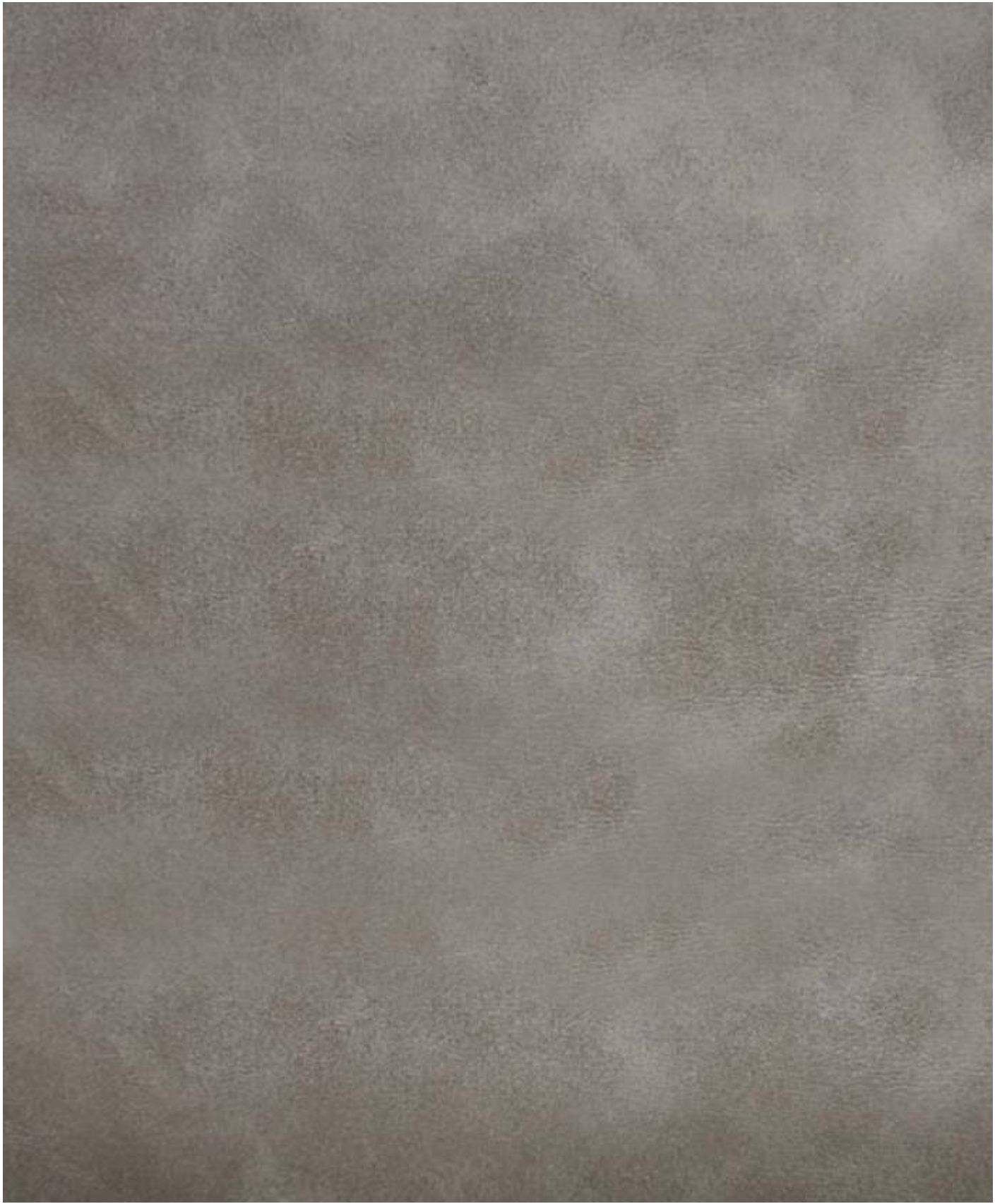
VINTAGE - 710