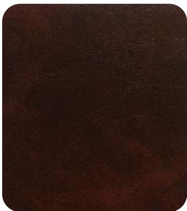
VINTAGE - 711