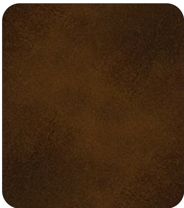
VINTAGE - 705