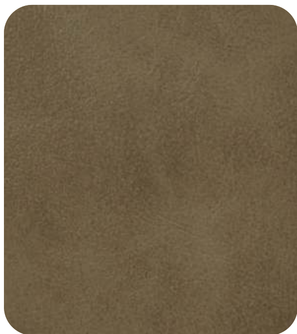
VINTAGE - 704