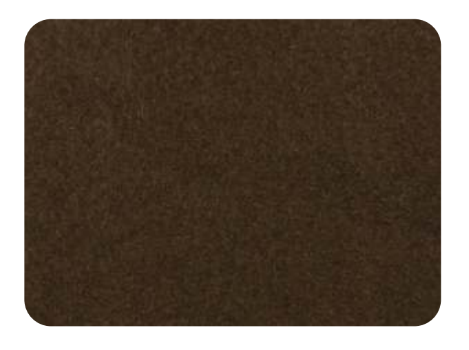
RENO - 904