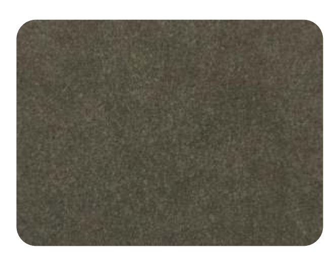
RENO - 912