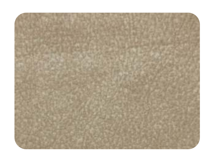
RENO - 901