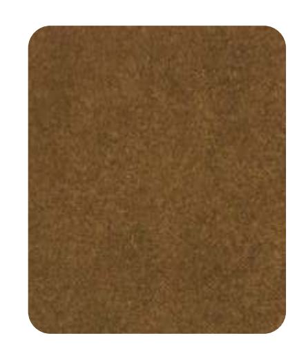
RENO - 905