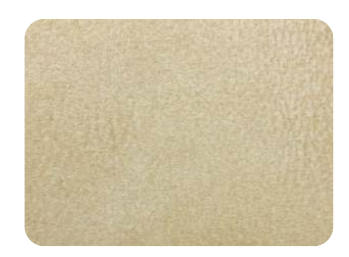
RENO - 917