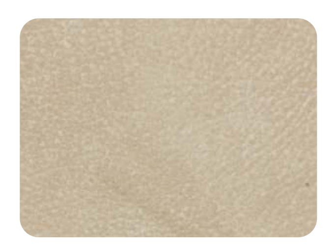
RENO - 916