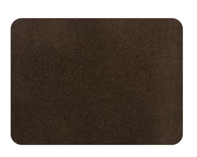
RENO - 907