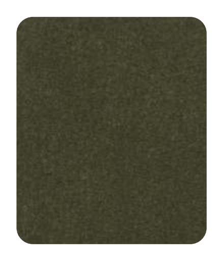
RENO - 909