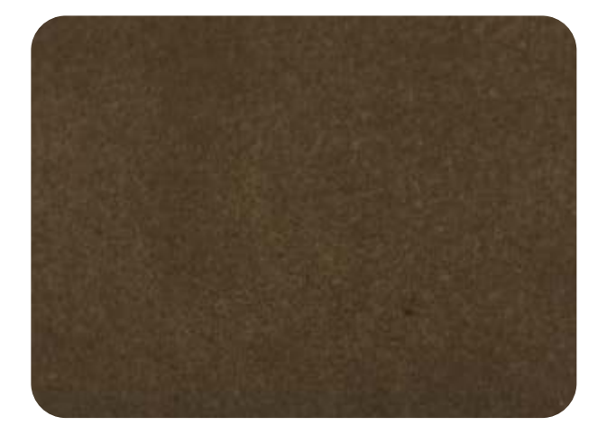
RENO - 903