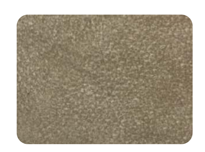
RENO - 911