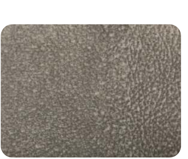
RENO - 915