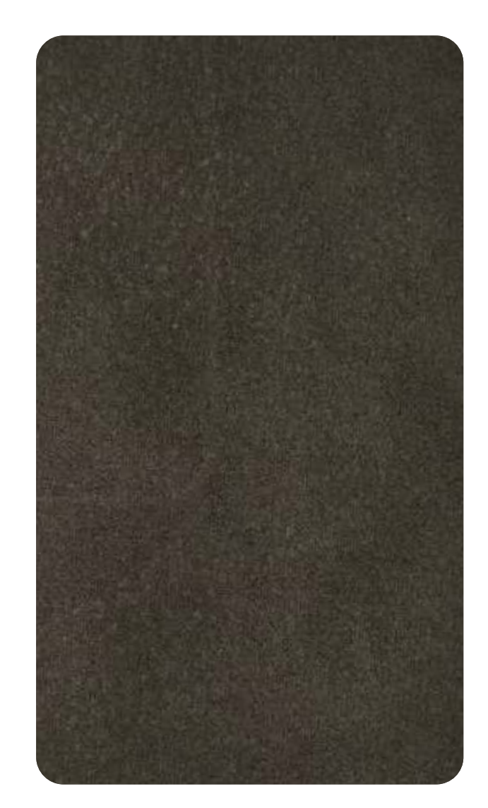
RENO - 913