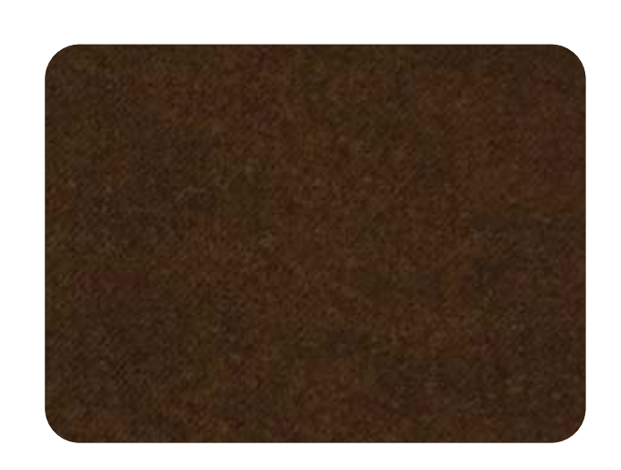
RENO - 906