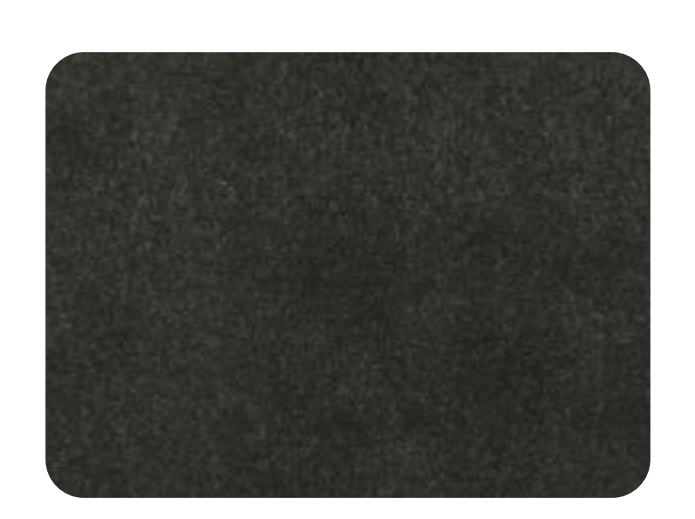
RENO - 914