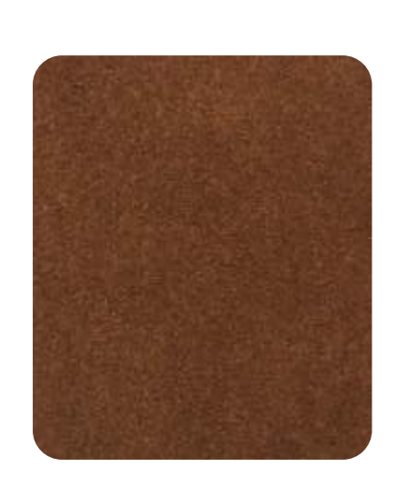
RENO - 908