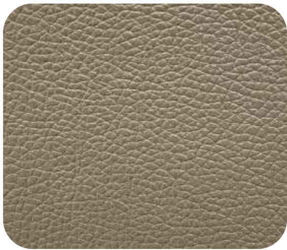
NEXON - 512