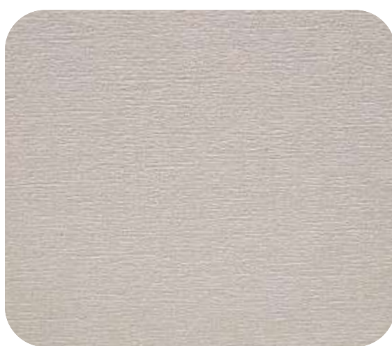
NEXON - 502