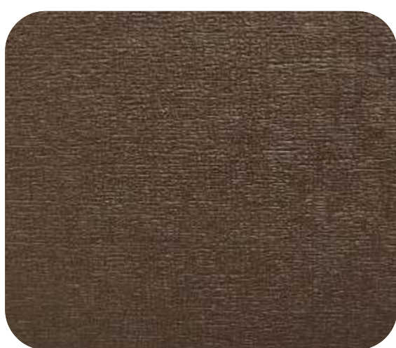
NEXON - 504