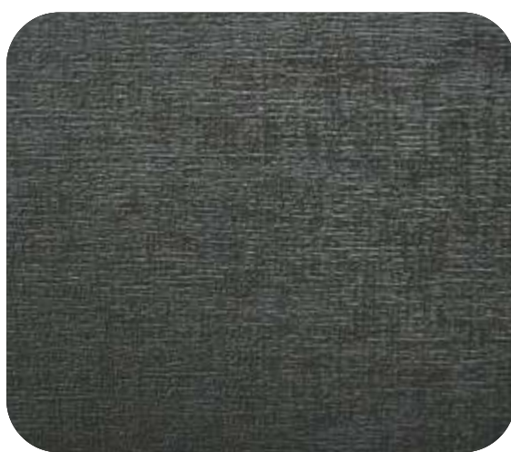
NEXON - 508