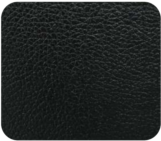
NEXON - 518