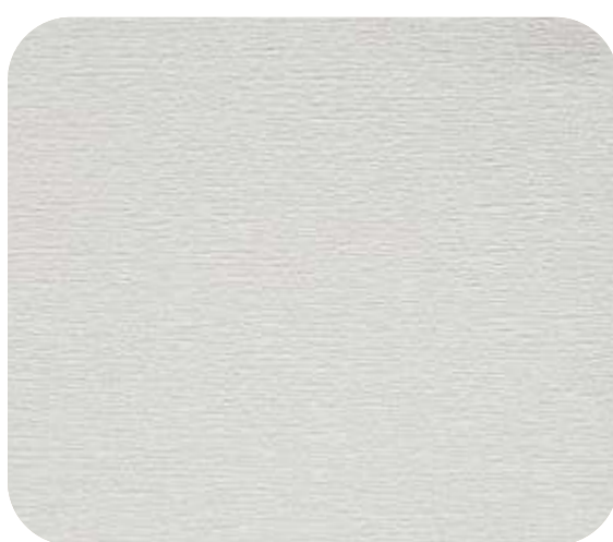
NEXON - 501