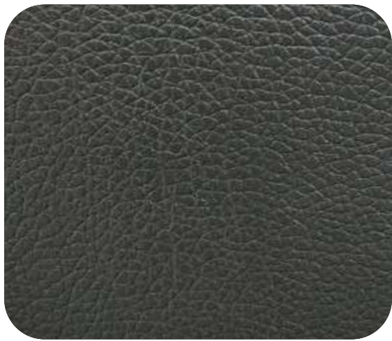
NEXON - 517