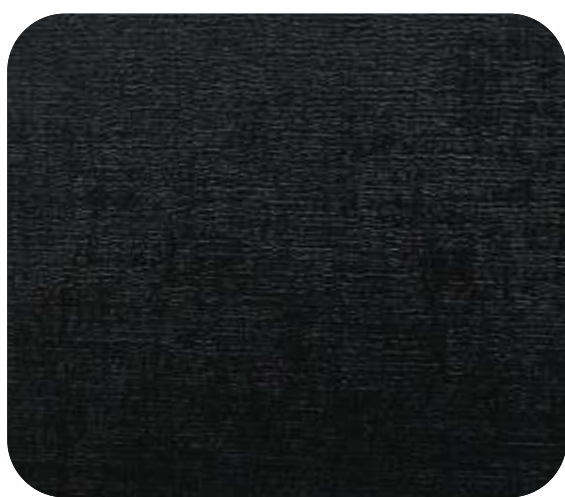
NEXON - 509