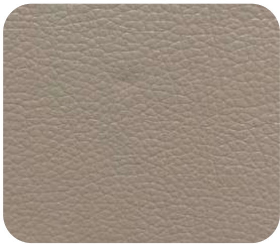
NEXON - 511