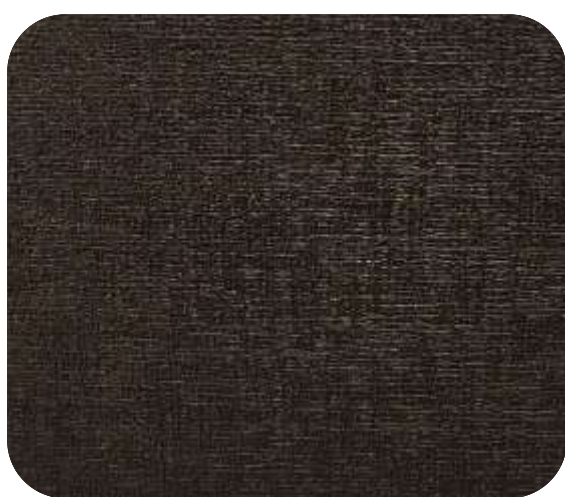
NEXON - 505