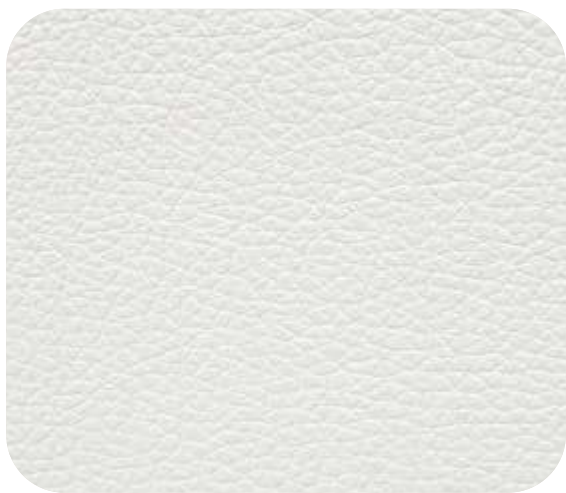
NEXON - 510