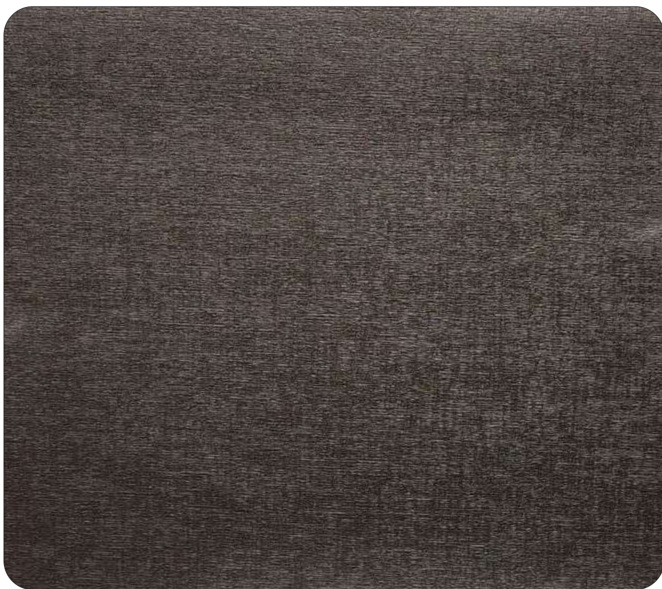
NEXON - 507