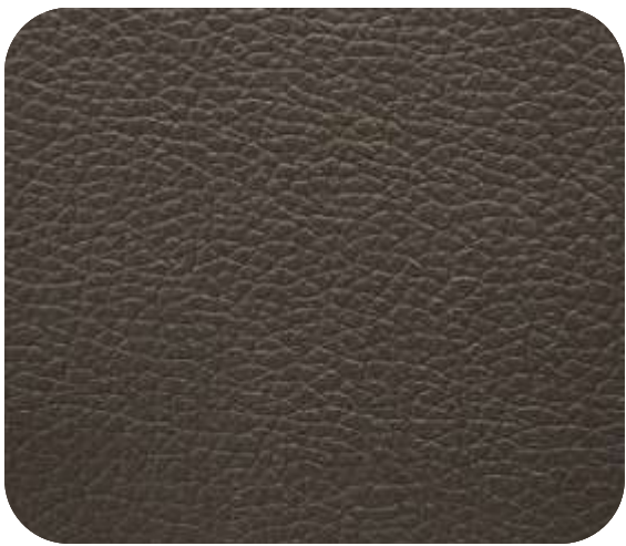
NEXON - 516