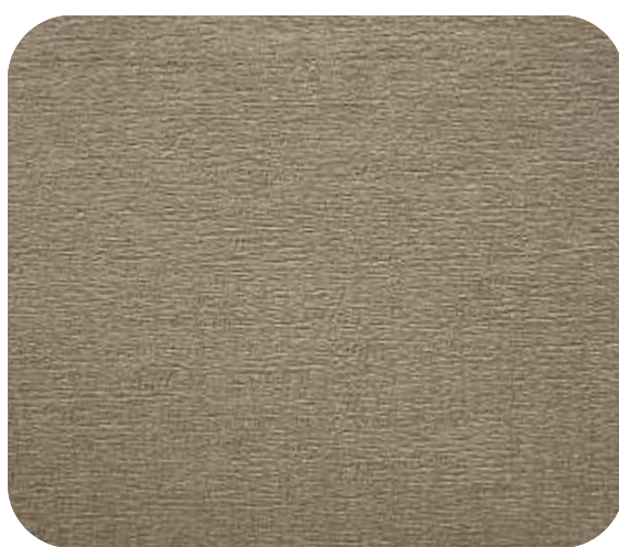
NEXON - 503