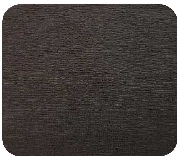
NEXON - 506