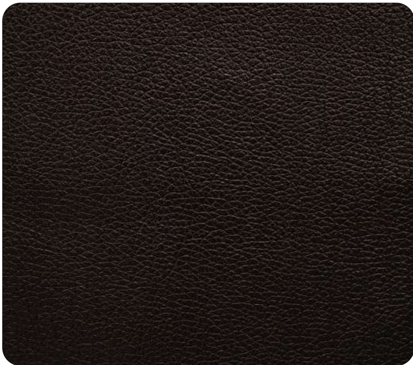
NEXON - 515