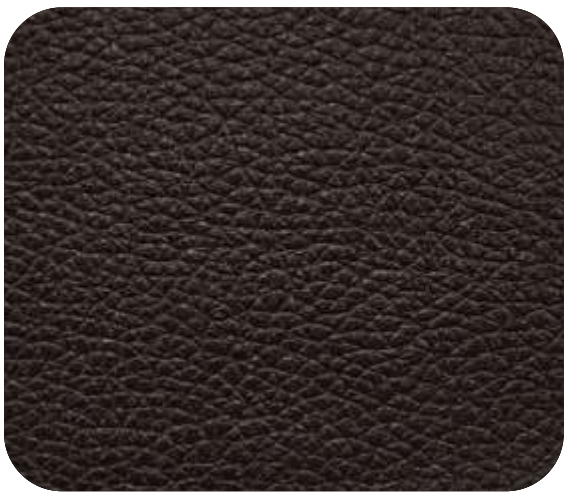
NEXON - 514