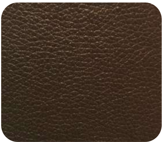
NEXON - 513