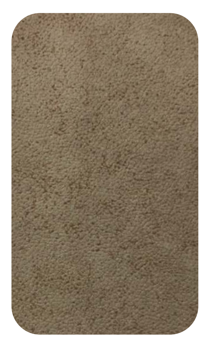
NAPPA - 903