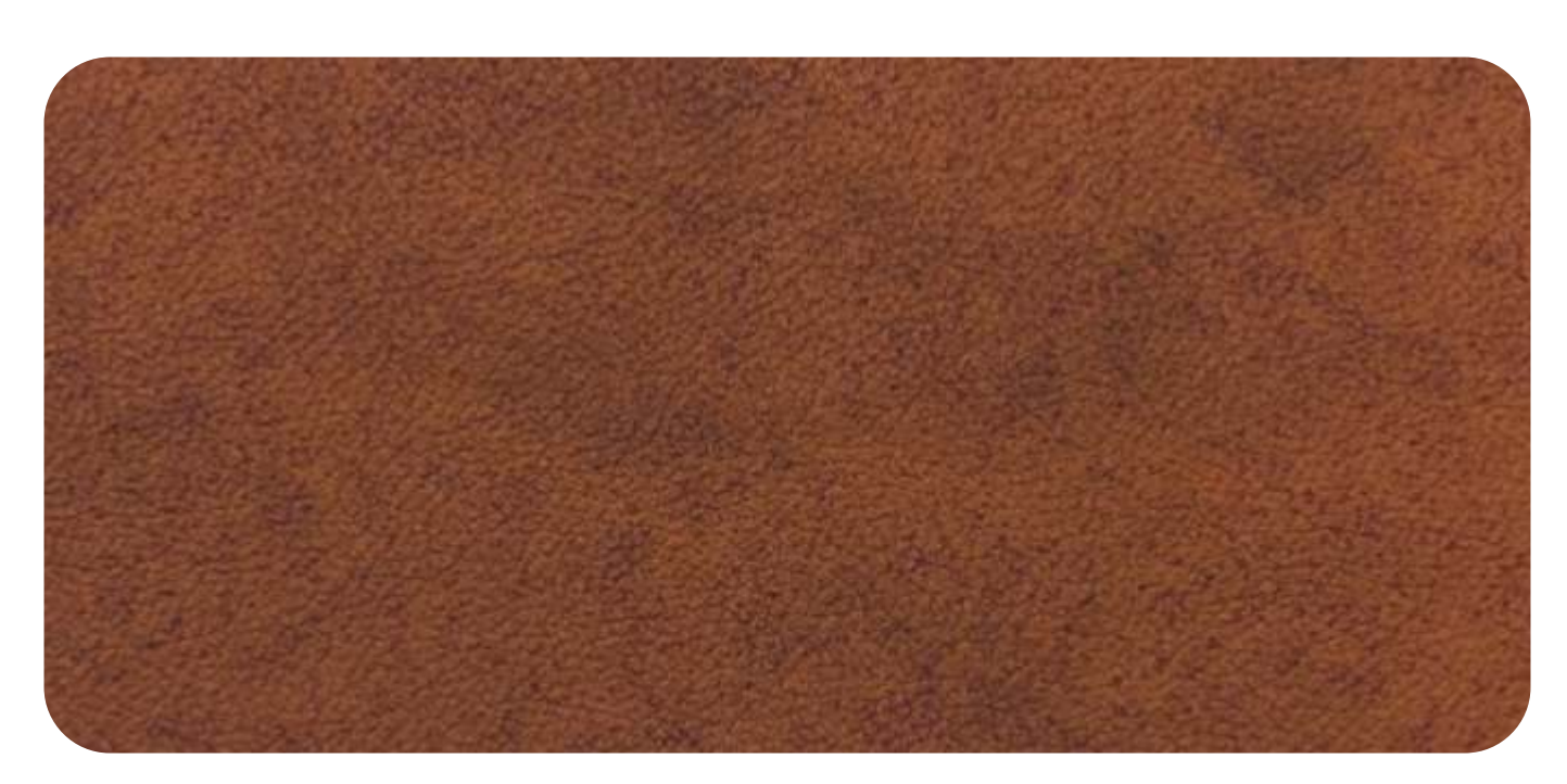
NAPPA - 910