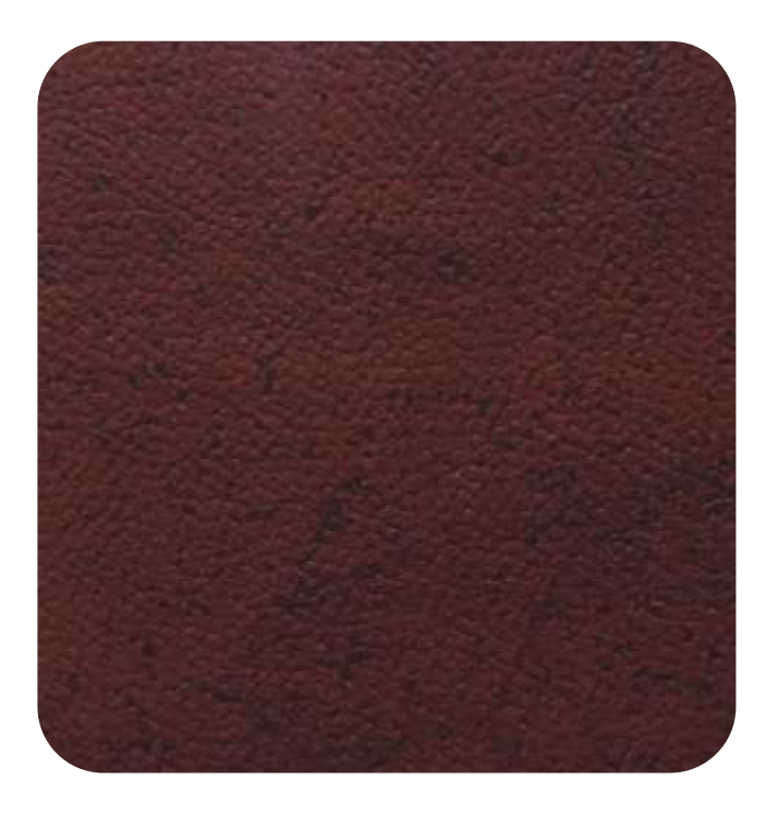
NAPPA - 911