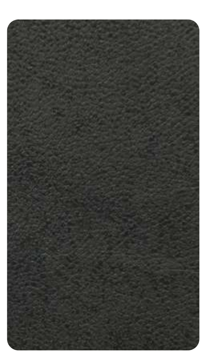
NAPPA - 914