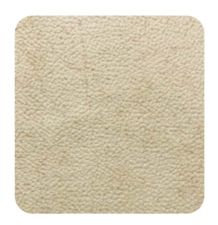
NAPPA - 901