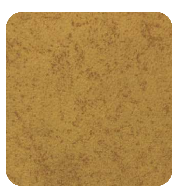
NAPPA - 909