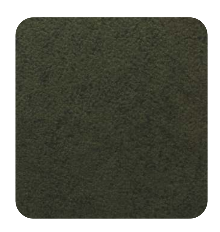
NAPPA - 912