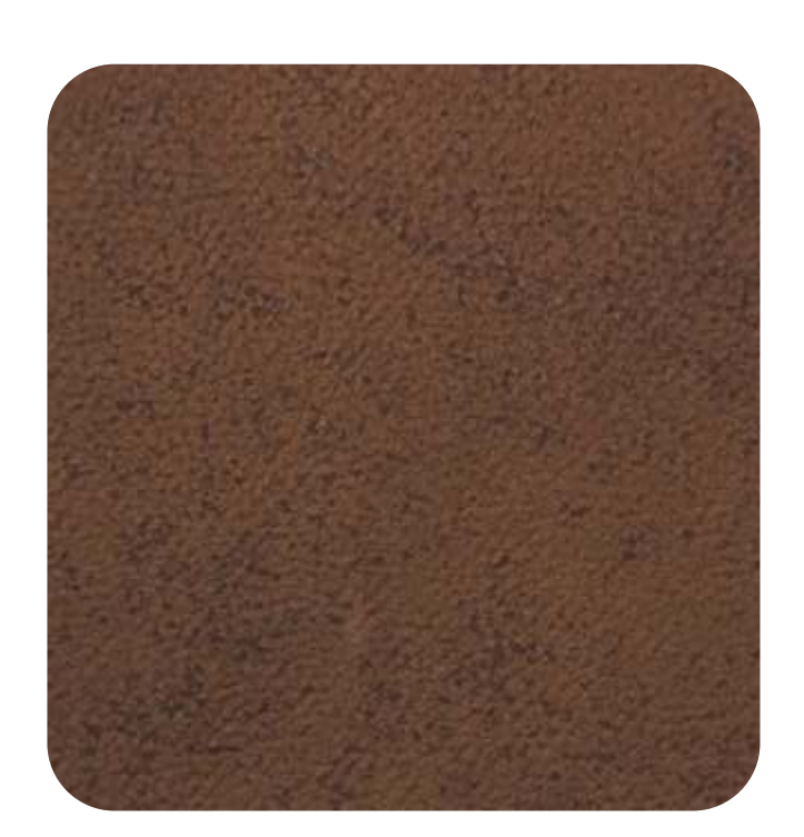
NAPPA - 908