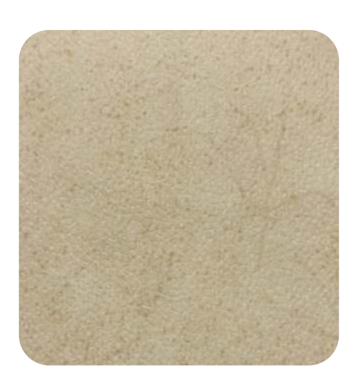
NAPPA - 902