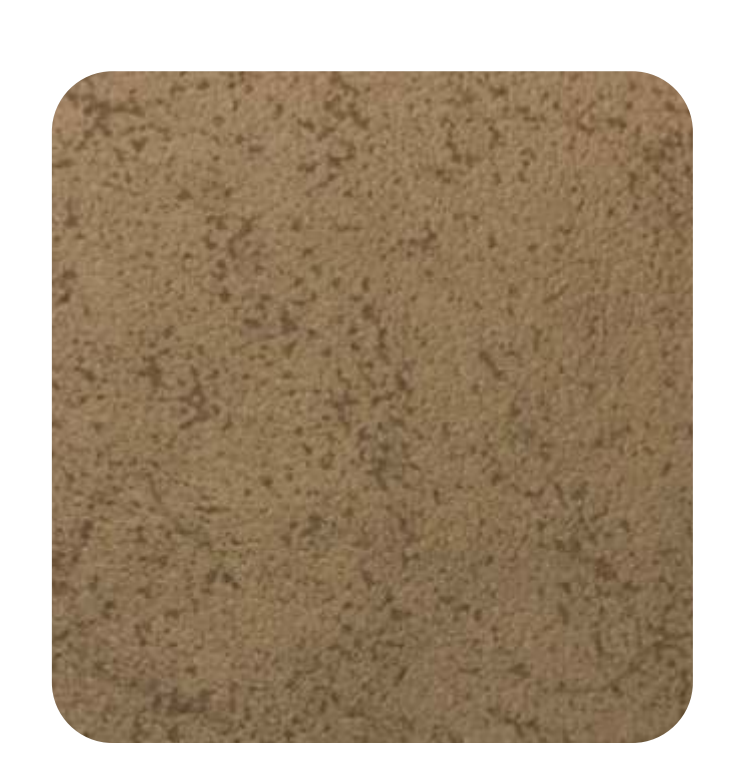
NAPPA - 904

\begin{array}{c} \text{Sarom} \\ \text{combinations unexpected} \end{array}