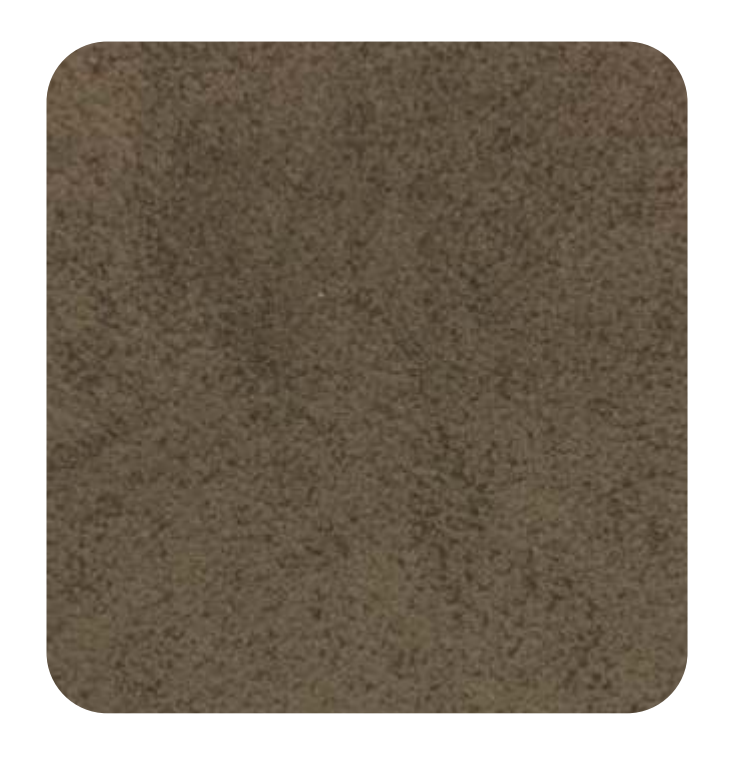
NAPPA - 905