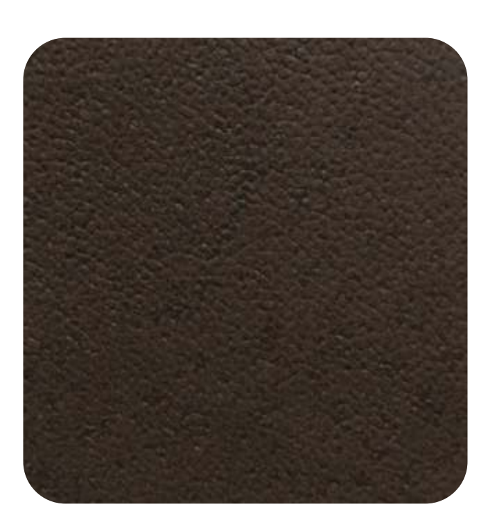
NAPPA - 907