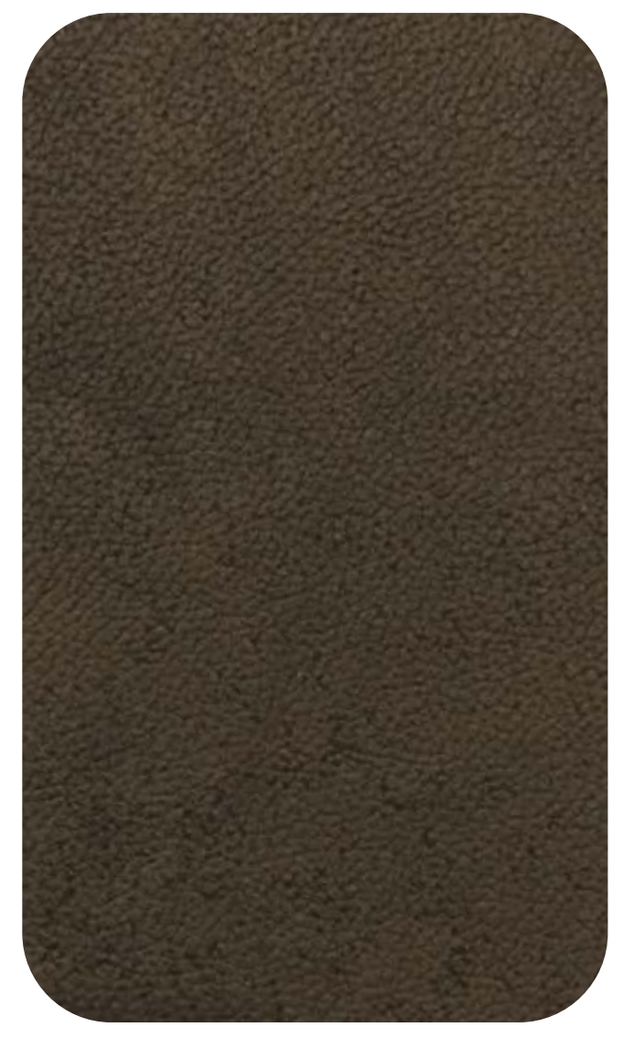
NAPPA - 906