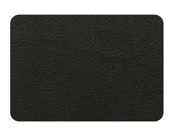
NAPPA - 915