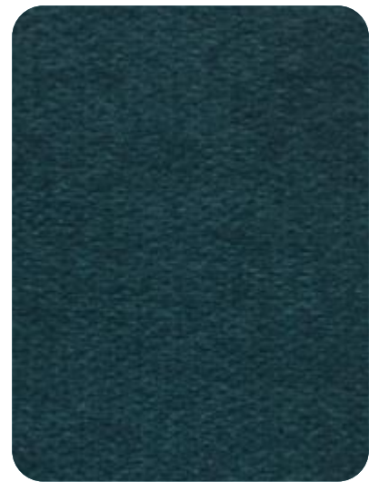
MISS - 915