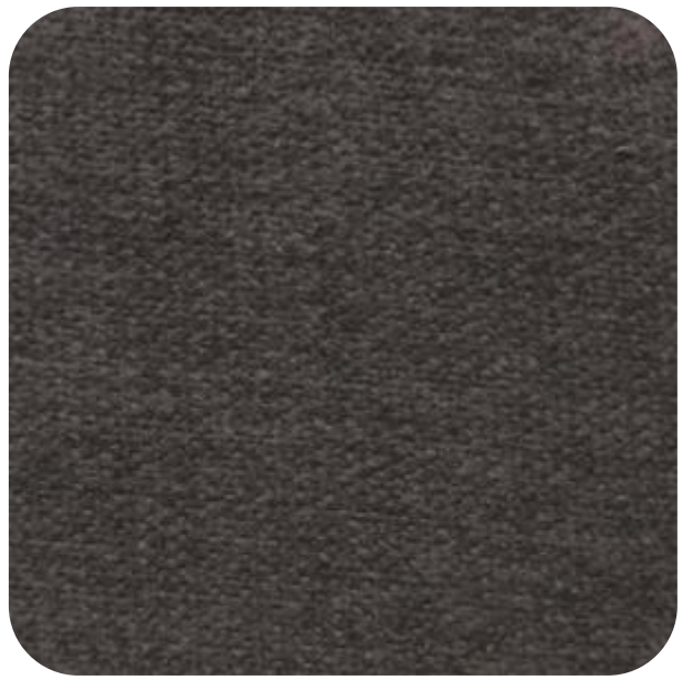
MISS - 911