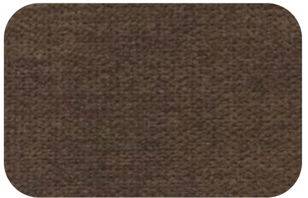
MISS - 905