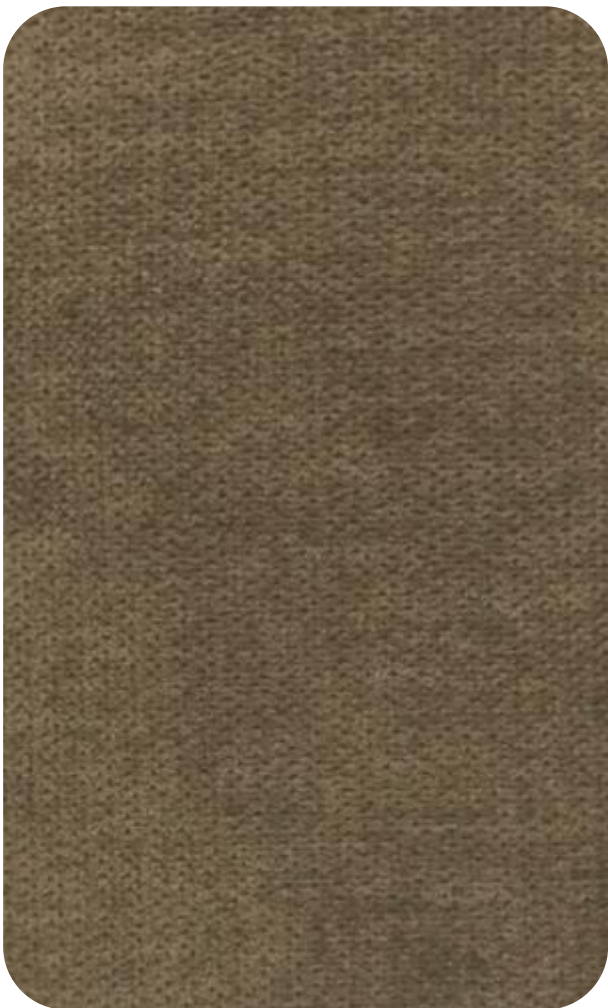
MISS - 904