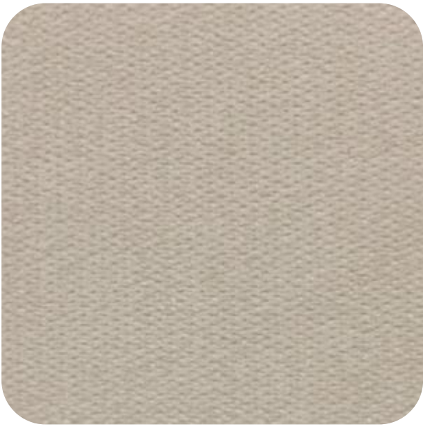
MISS - 901