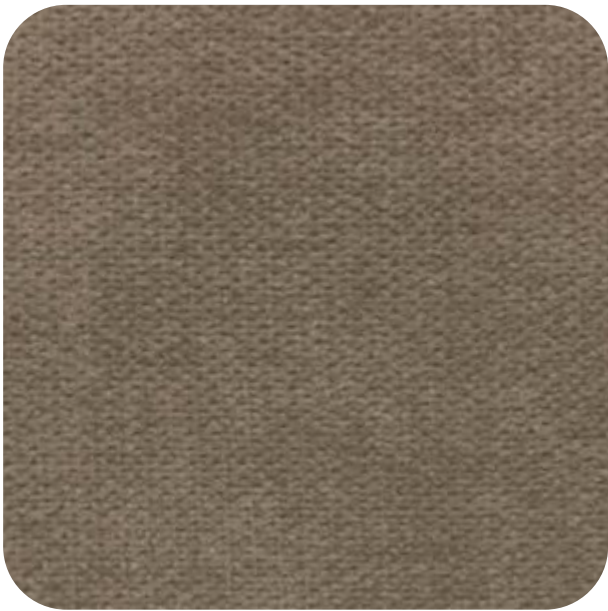
MISS - 903