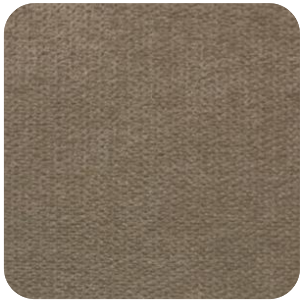
MISS - 909