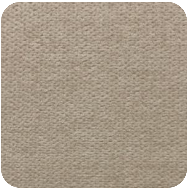
MISS - 902