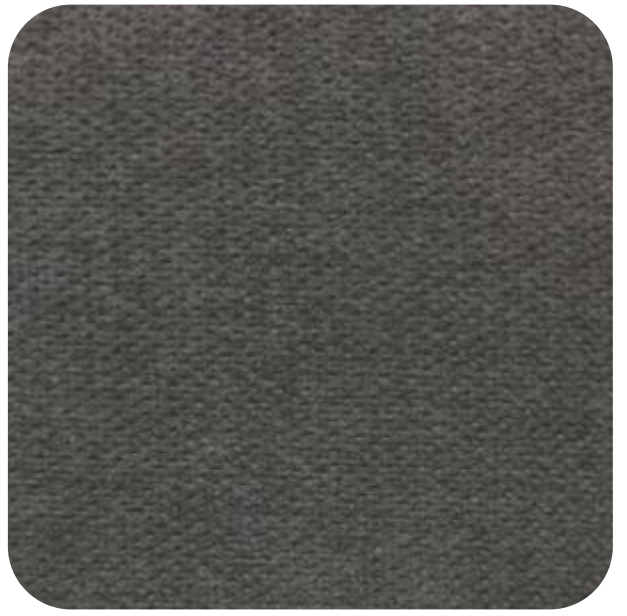
MISS - 912