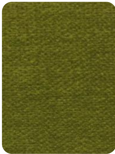
MISS - 916