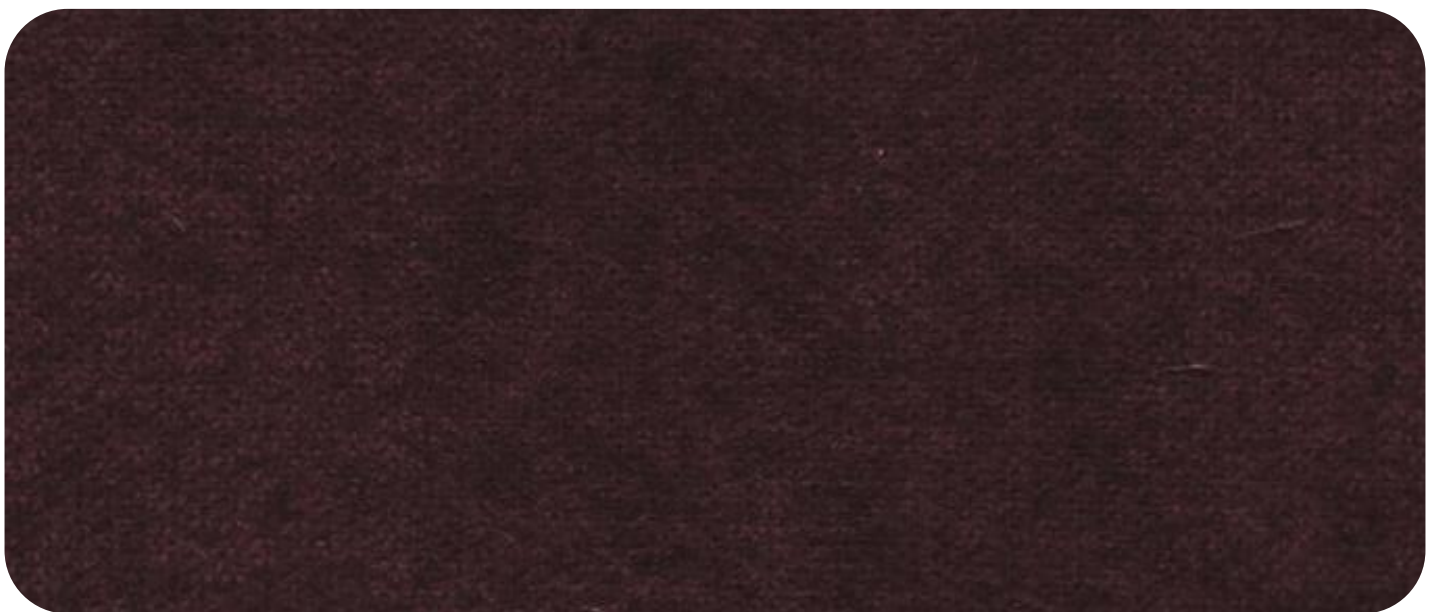
MISS - 914