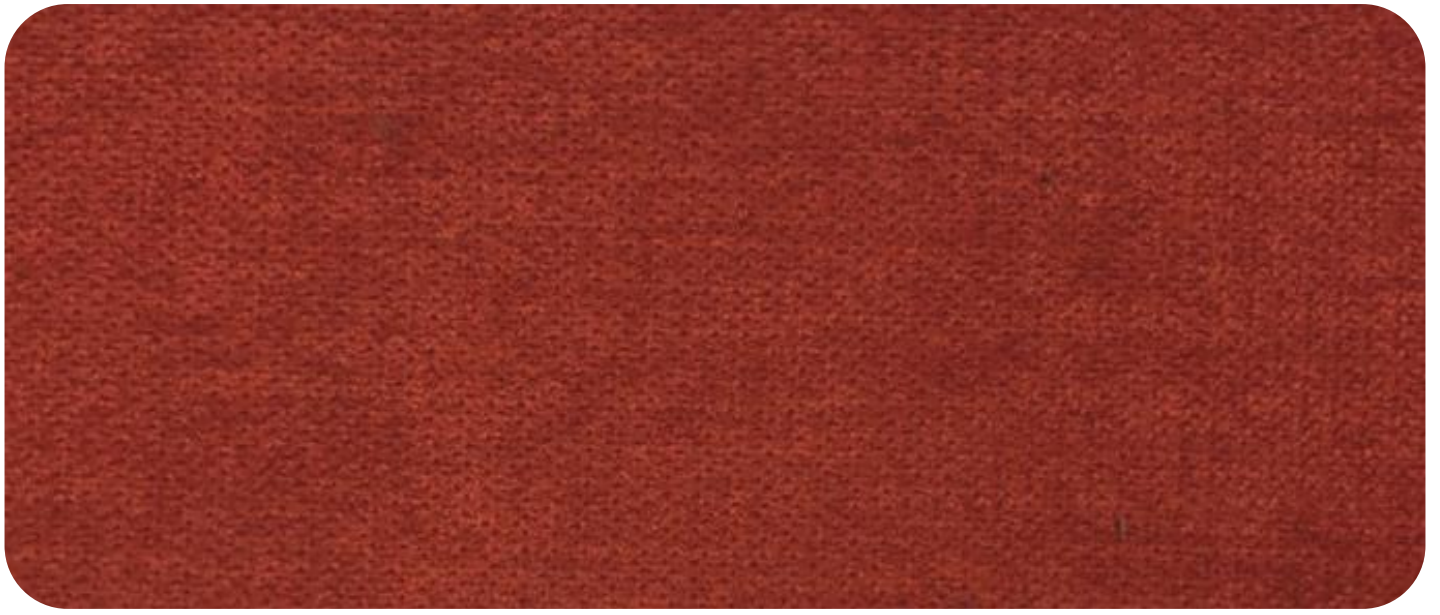
MISS - 917