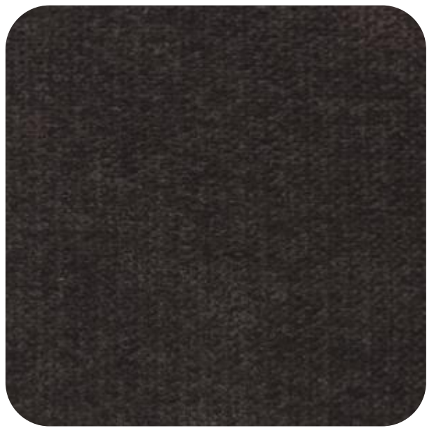
MISS - 913