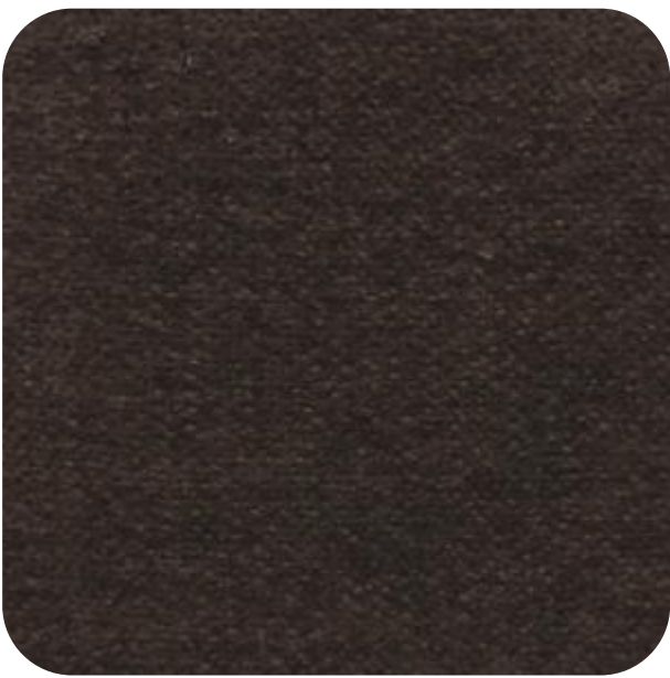
MISS - 907