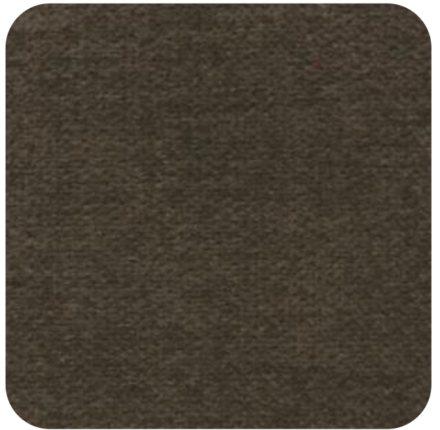
MISS - 906