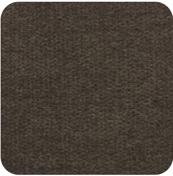
MISS - 910