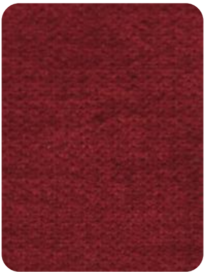
MISS - 918