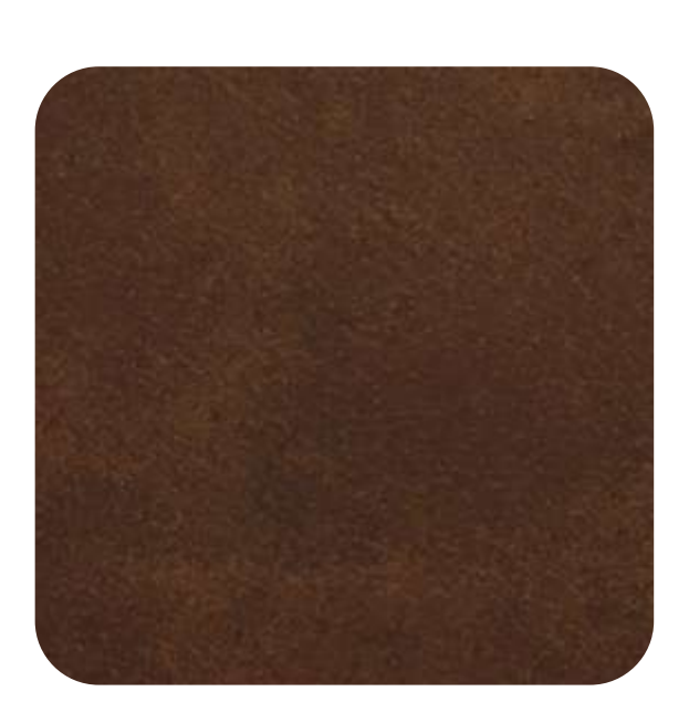
COWBOY - 906