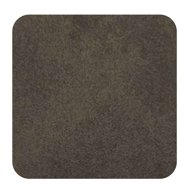
COWBOY - 909