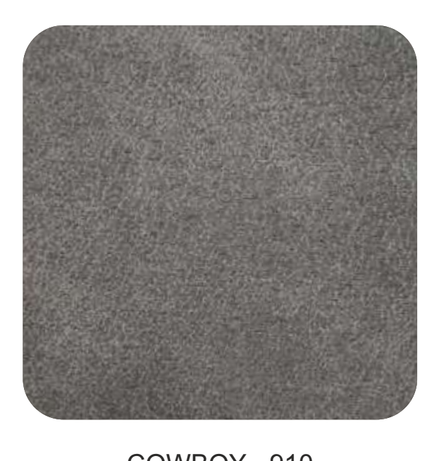
COWBOY - 910