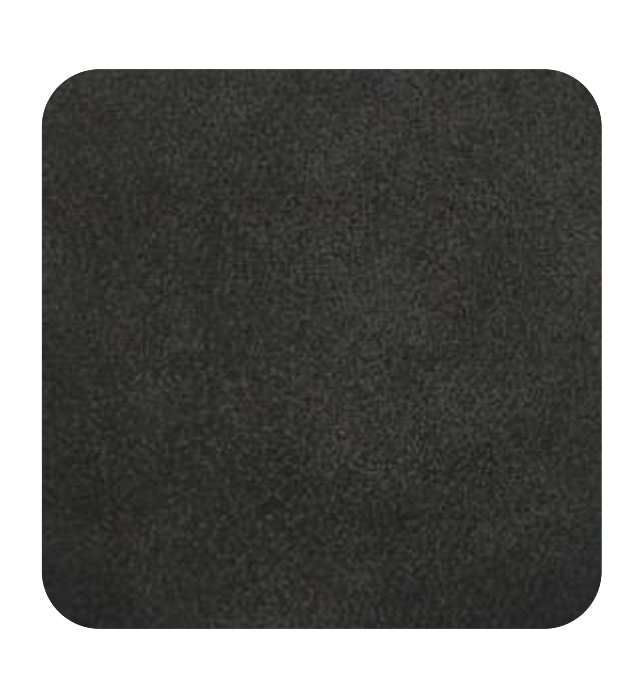
COWBOY - 912