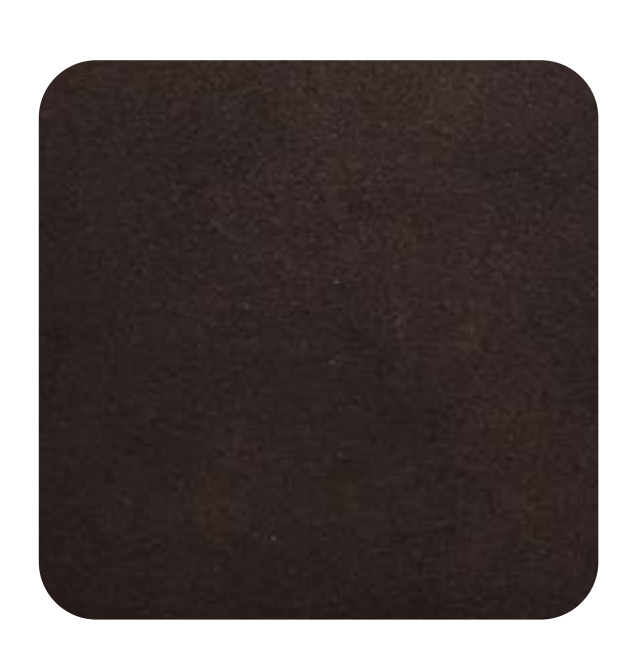
COWBOY - 908