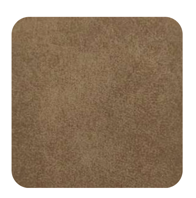
COWBOY - 903