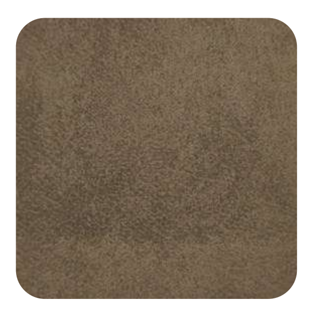
COWBOY - 902