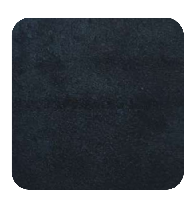
COWBOY - 915