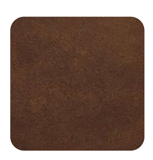
COWBOY - 905