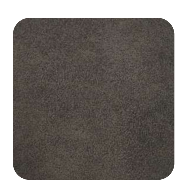
COWBOY - 911