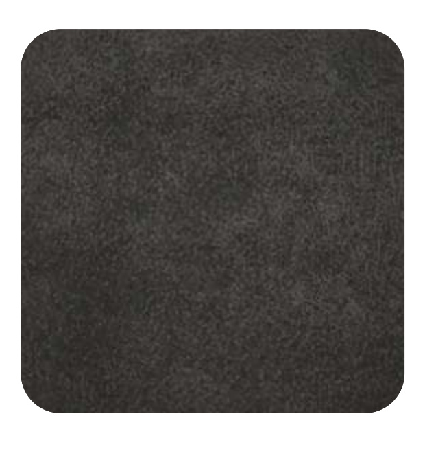
COWBOY - 913