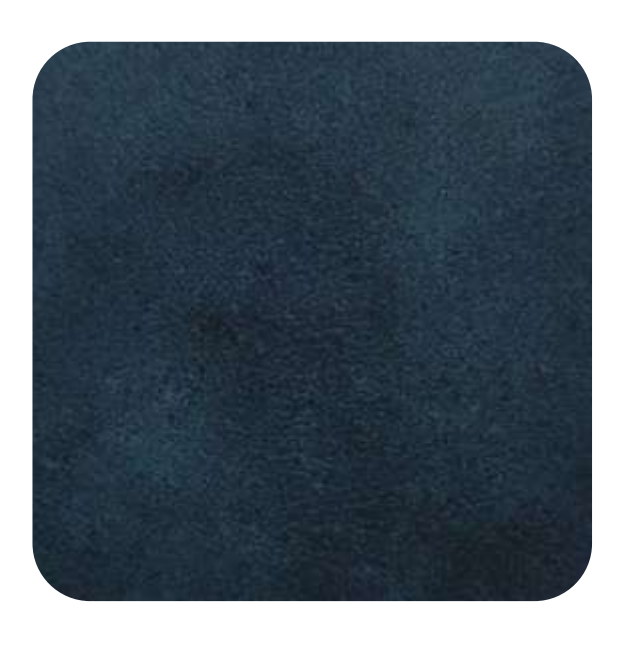
COWBOY - 914