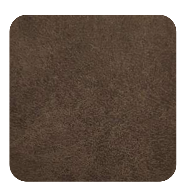
COWBOY - 904