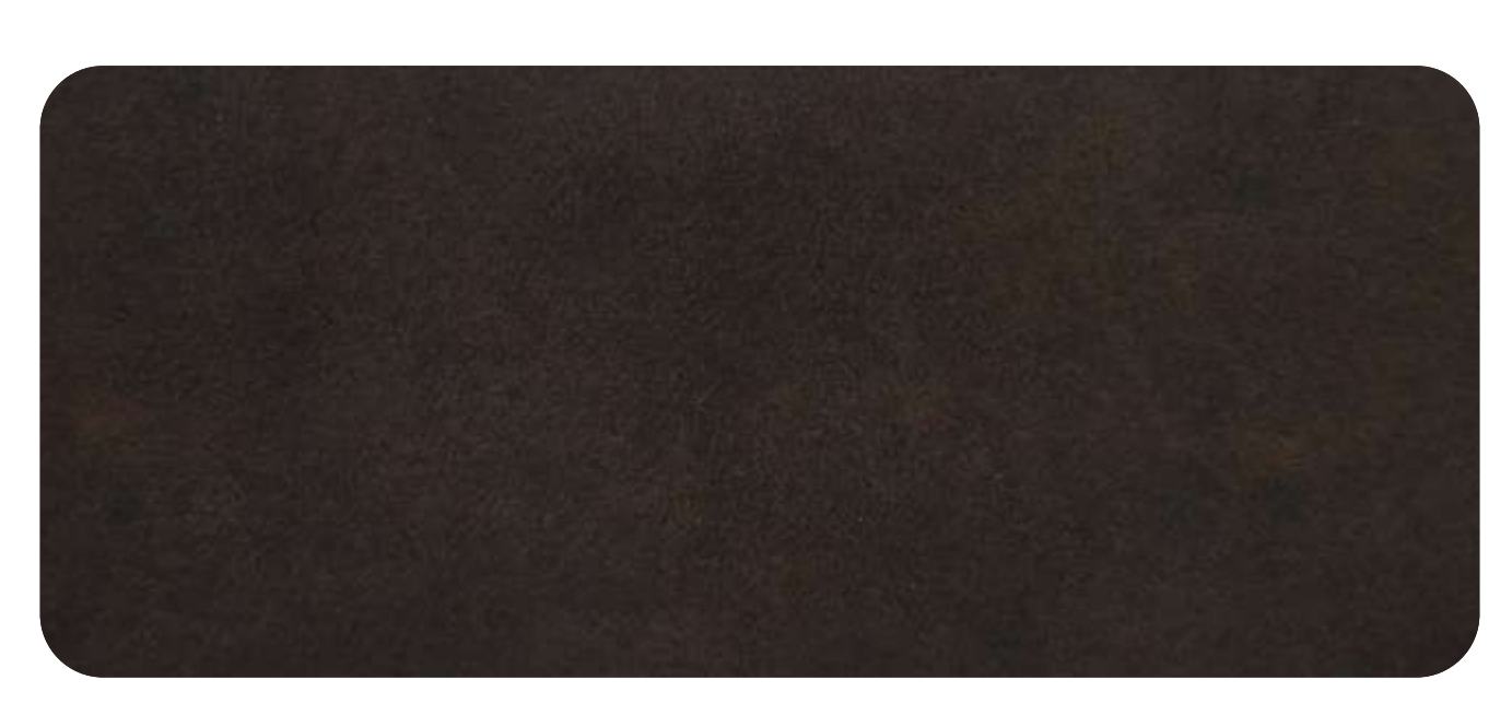
COWBOY - 907