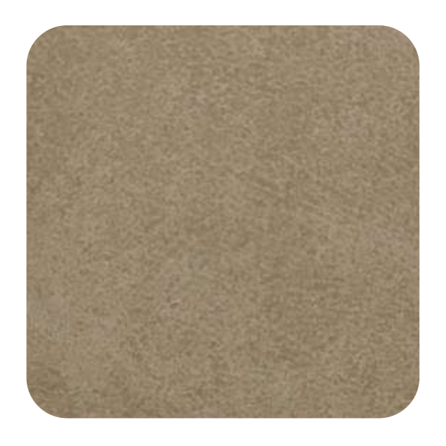
COWBOY - 901