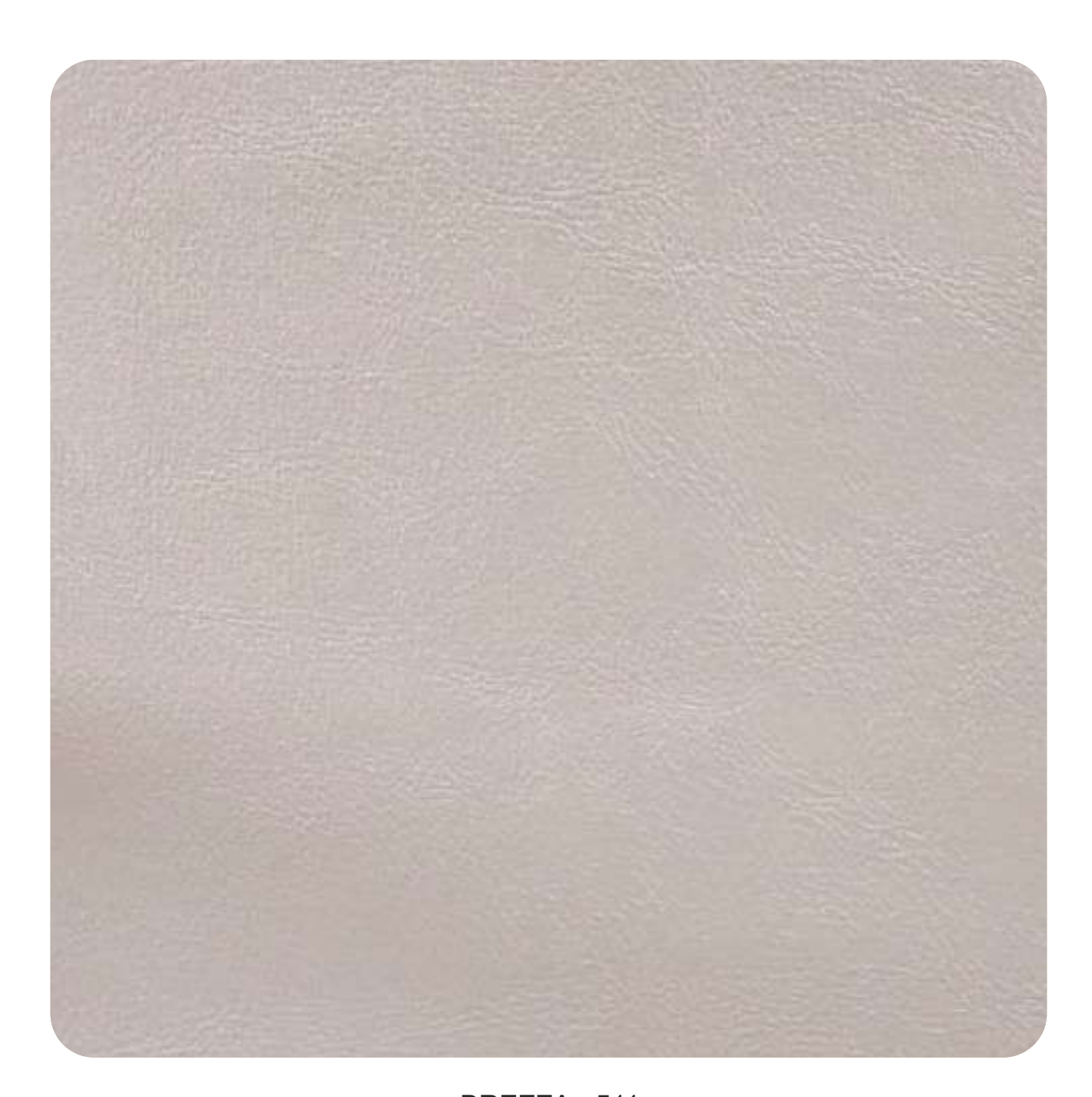
BREZZA - 511