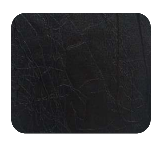
BREZZA - 509