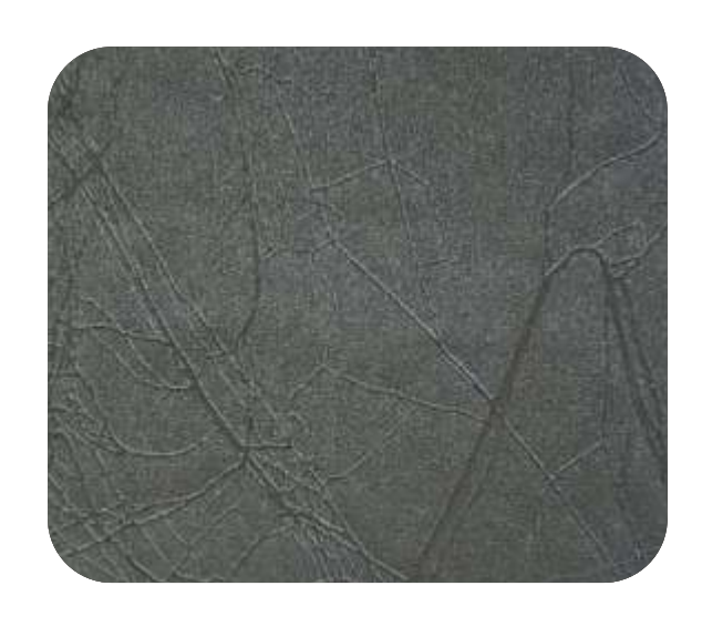
BREZZA - 508