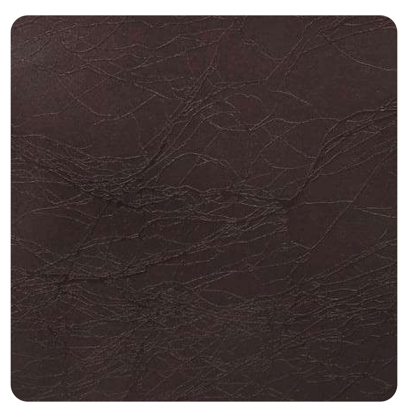
BREZZA - 506