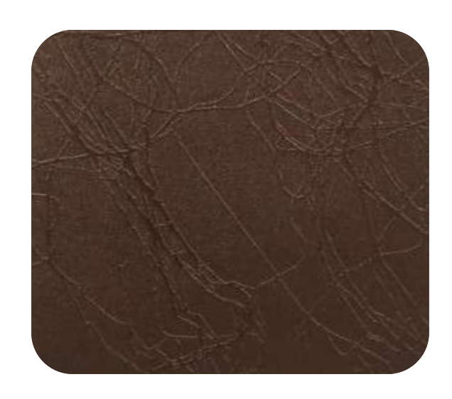
BREZZA - 504