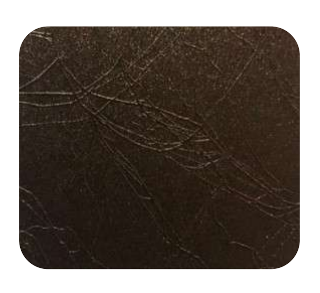
BREZZA - 505