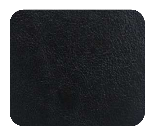
BREZZA - 518