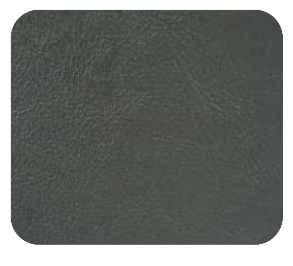
BREZZA - 517