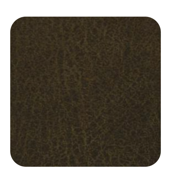
BOSTON - 910