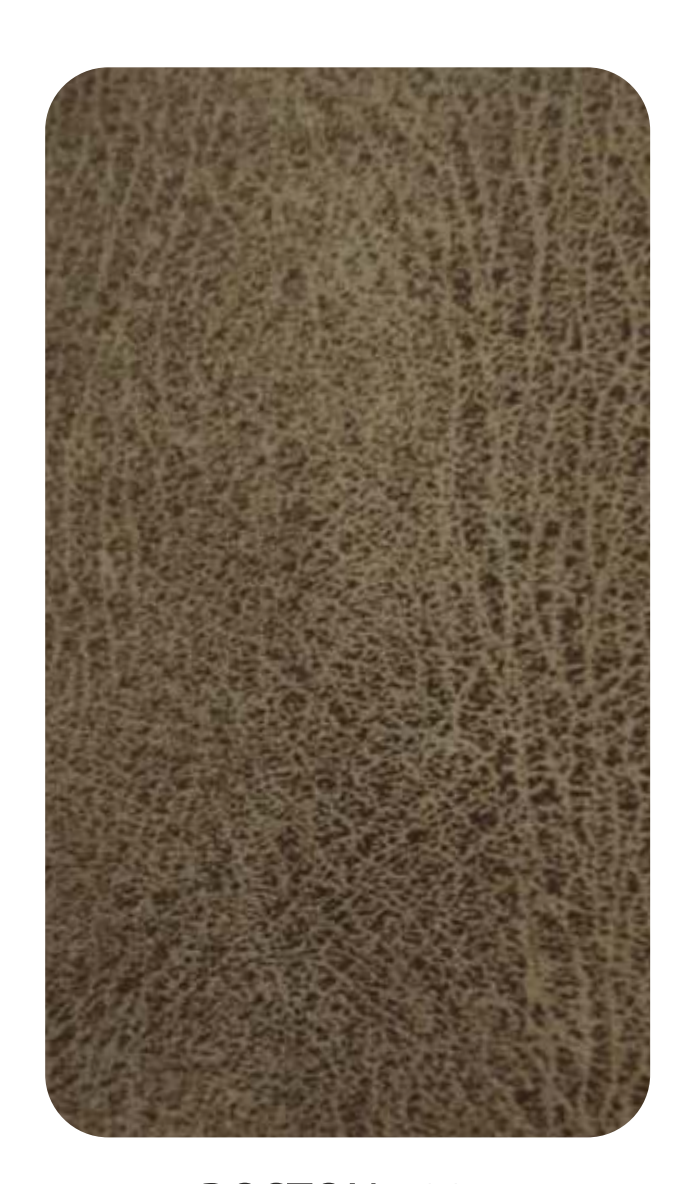
BOSTON - 904