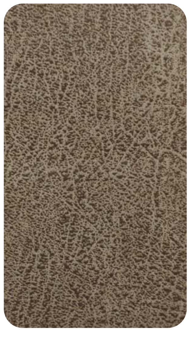
BOSTON - 903