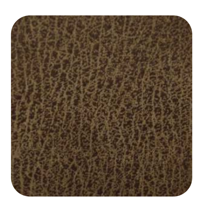
BOSTON - 905