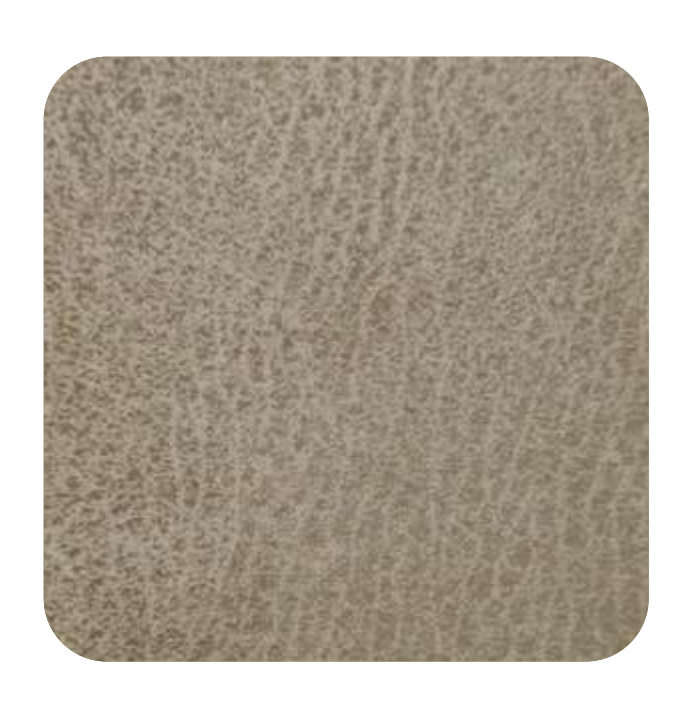
BOSTON - 901