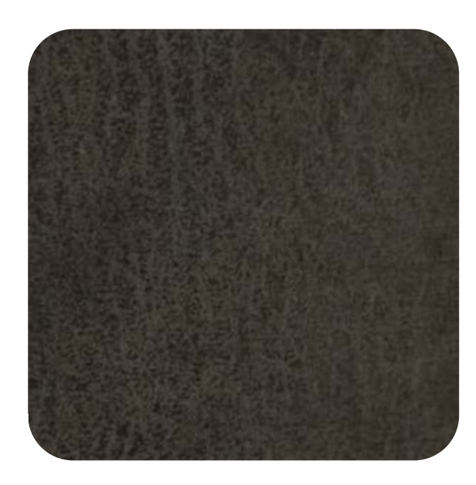
BOSTON - 912