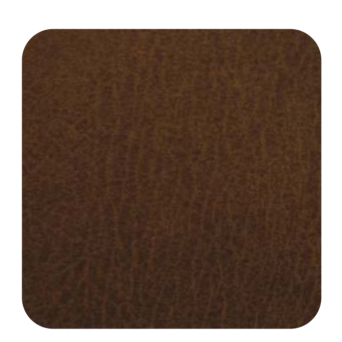
BOSTON - 906