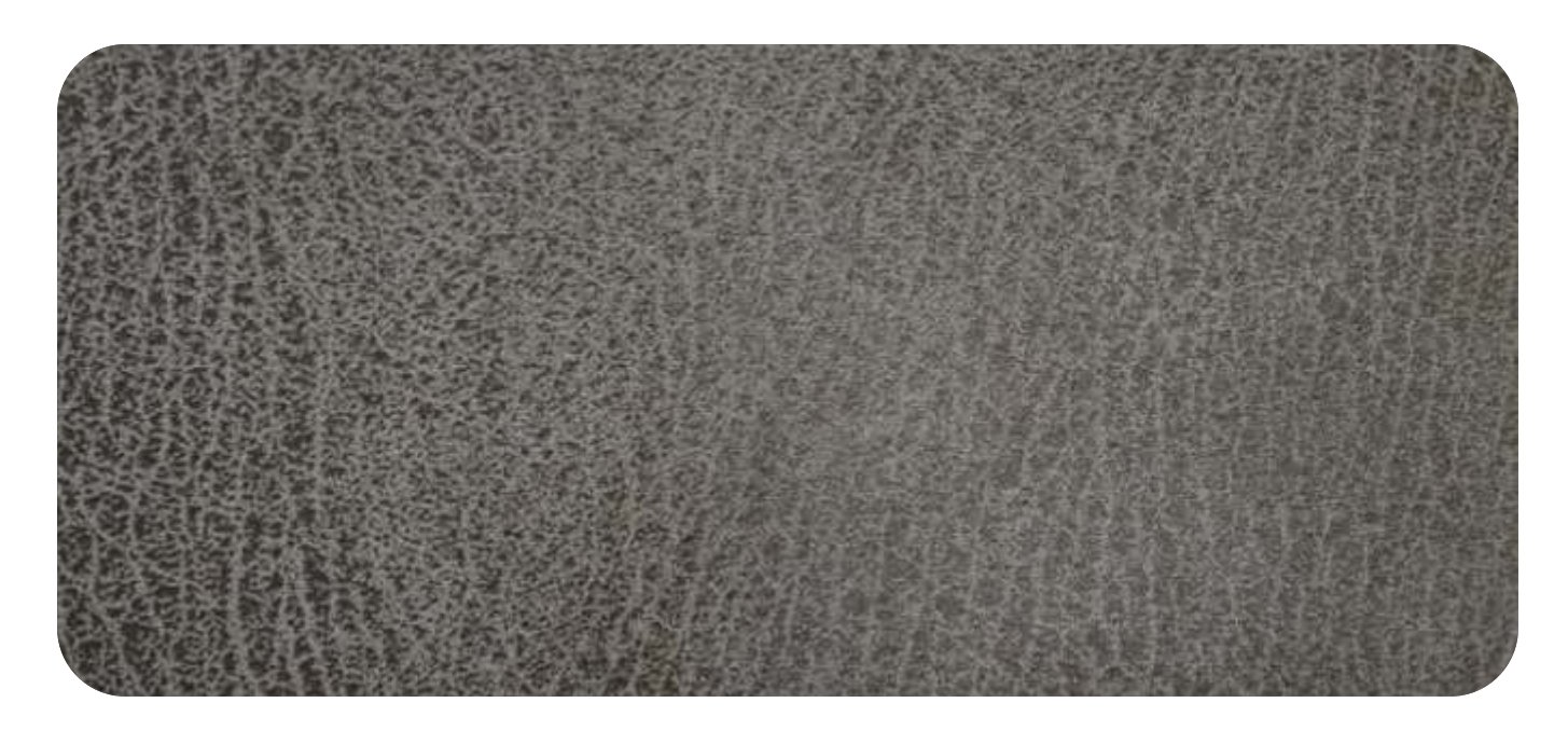
BOSTON - 911