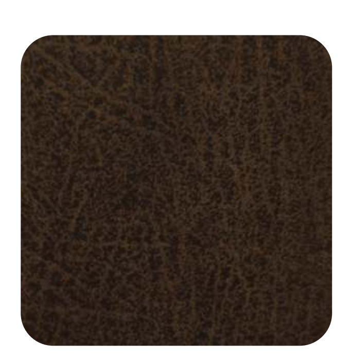
BOSTON - 908