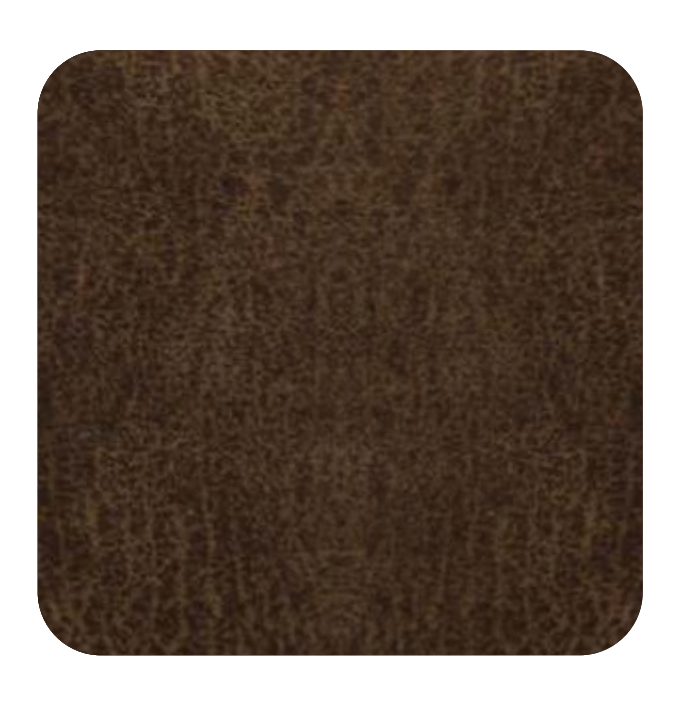
BOSTON - 907