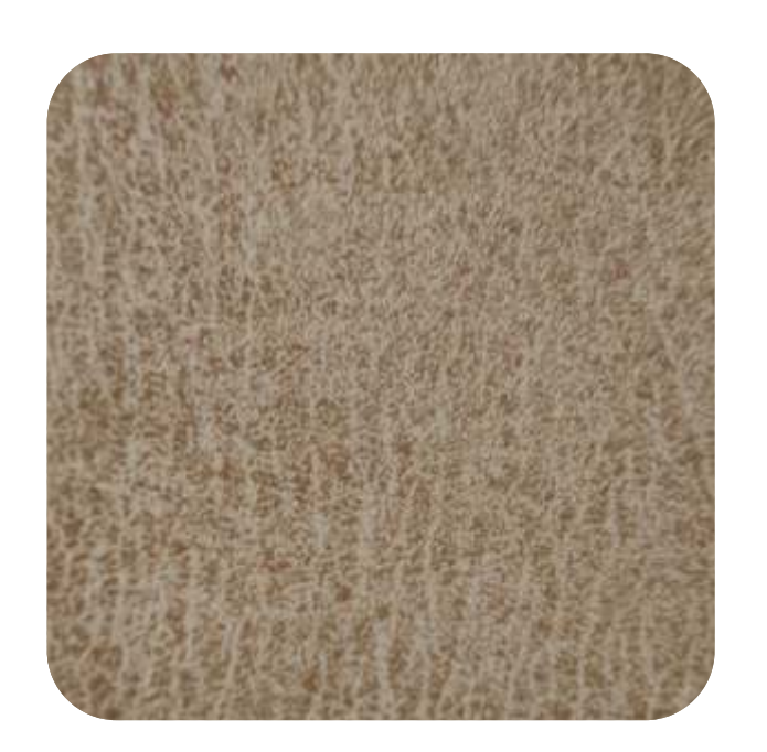
BOSTON - 902