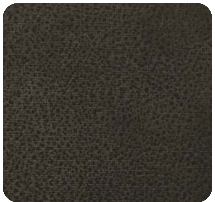
ASHLEY - 712