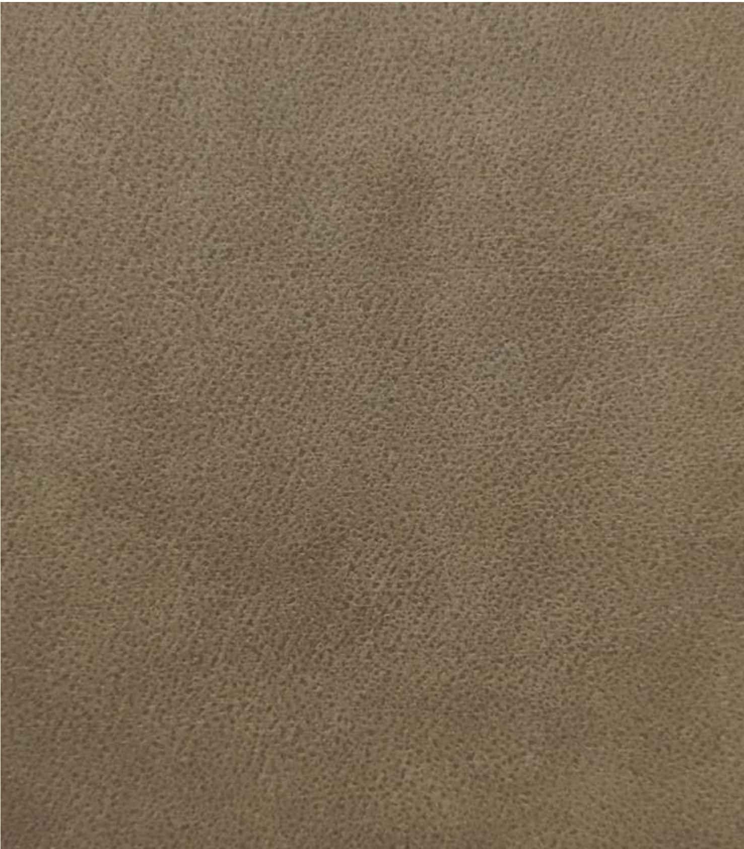
ASHLEY - 703