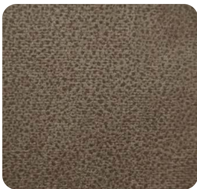
ASHLEY - 706