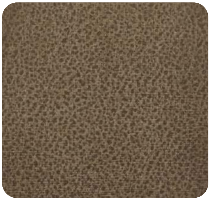
ASHLEY - 704