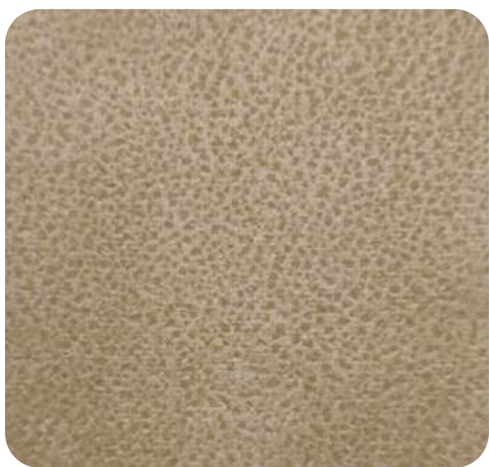
ASHLEY - 701