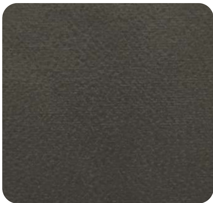
ASHLEY - 711