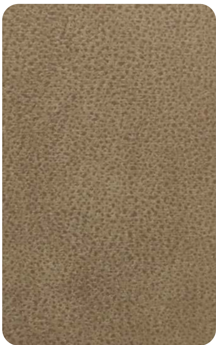
ASHLEY - 703