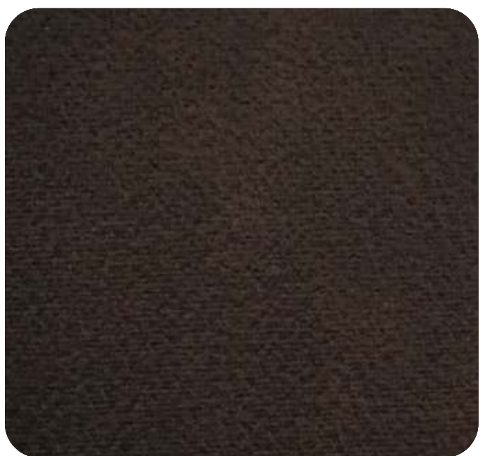
ASHLEY - 709