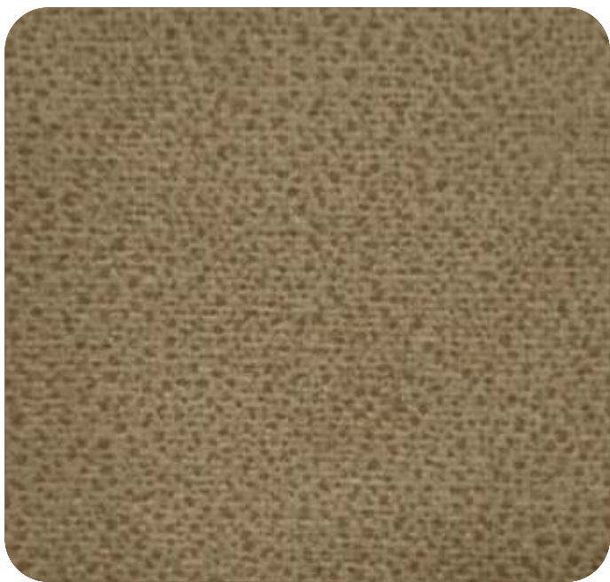
ASHLEY - 705