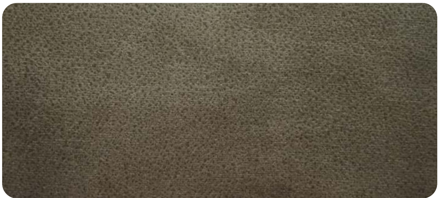
ASHLEY - 710