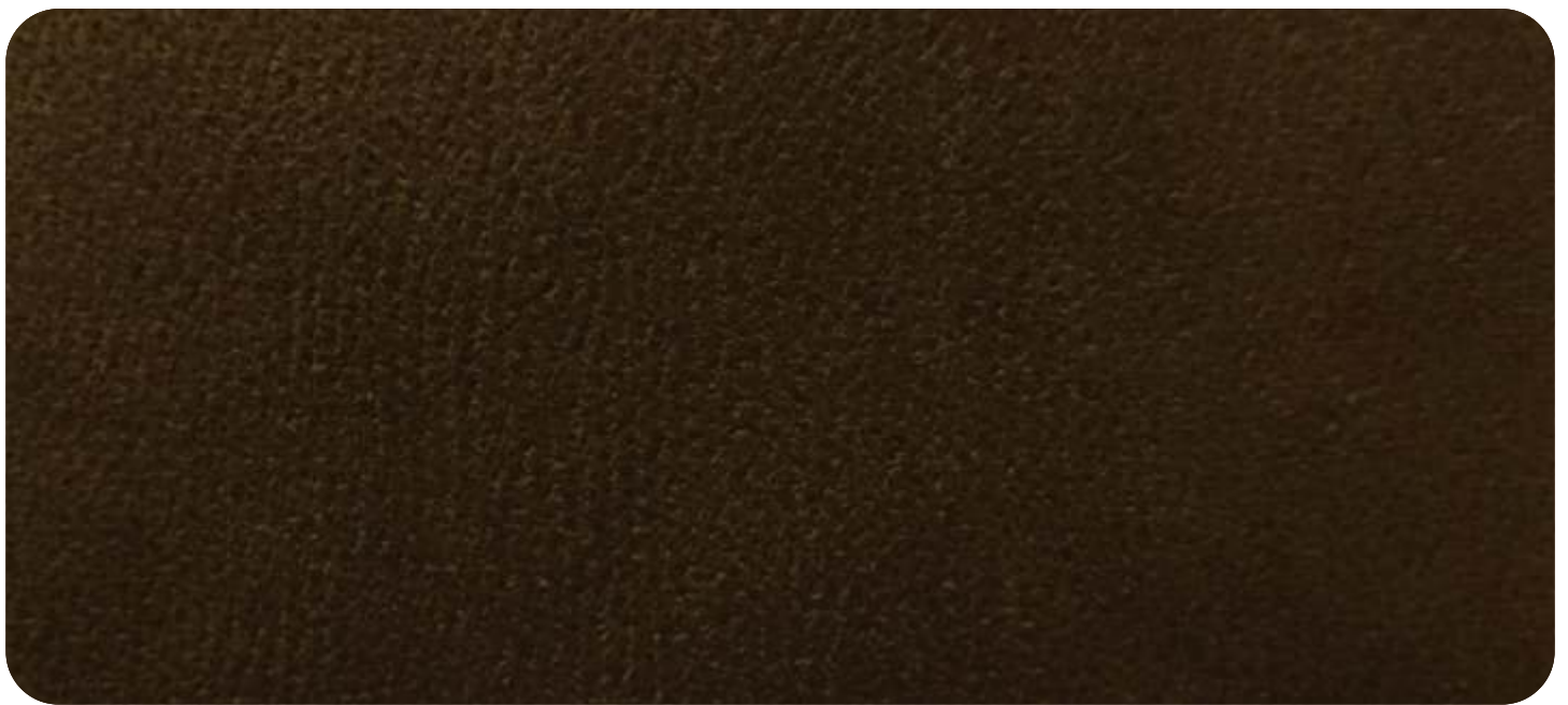
ASHLEY - 707