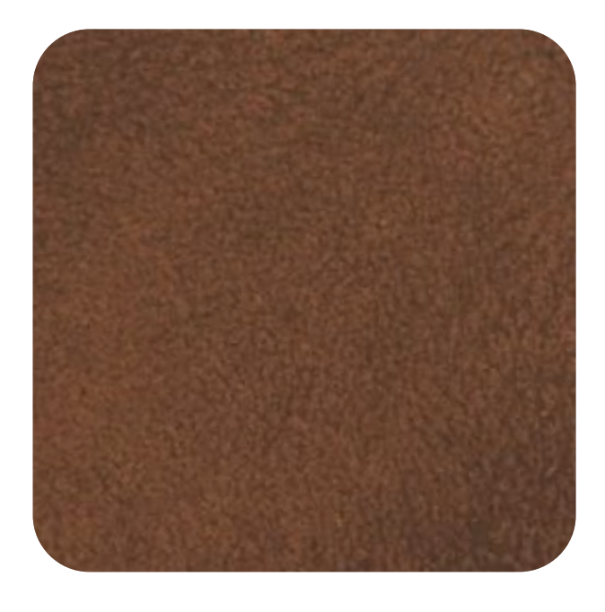
ANCONA - 910