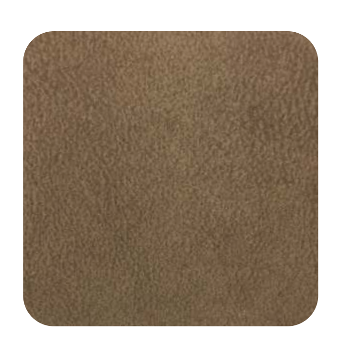
ANCONA - 904