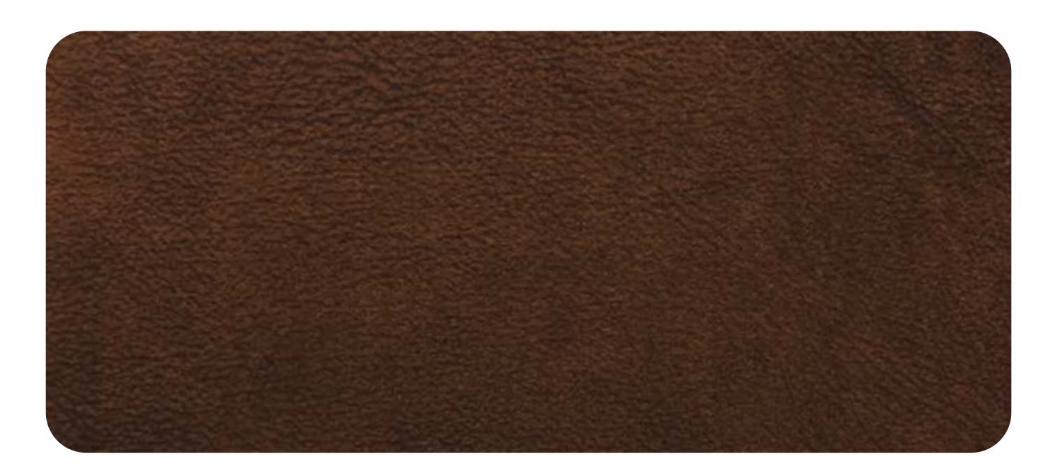
ANCONA - 906