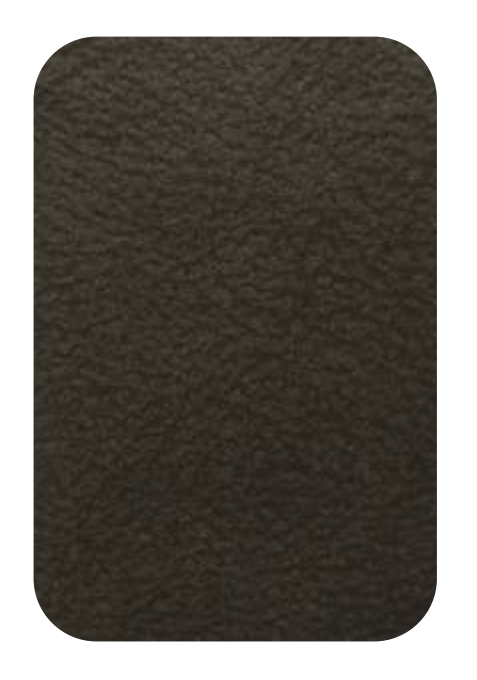
ANCONA - 915 ANCONA - 914