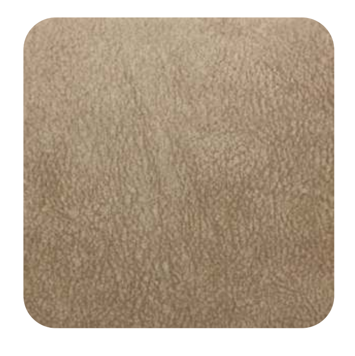
ANCONA - 902