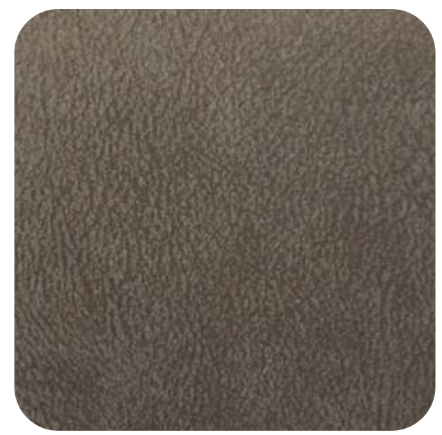
ANCONA - 918