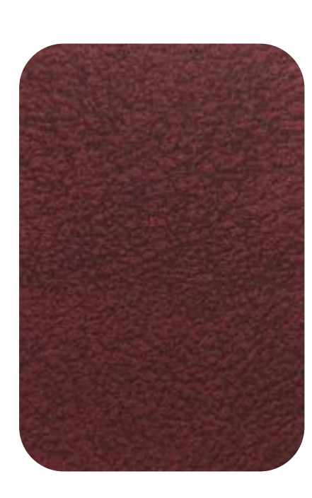
ANCONA - 913