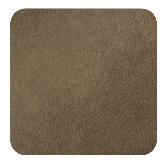
ANCONA - 903