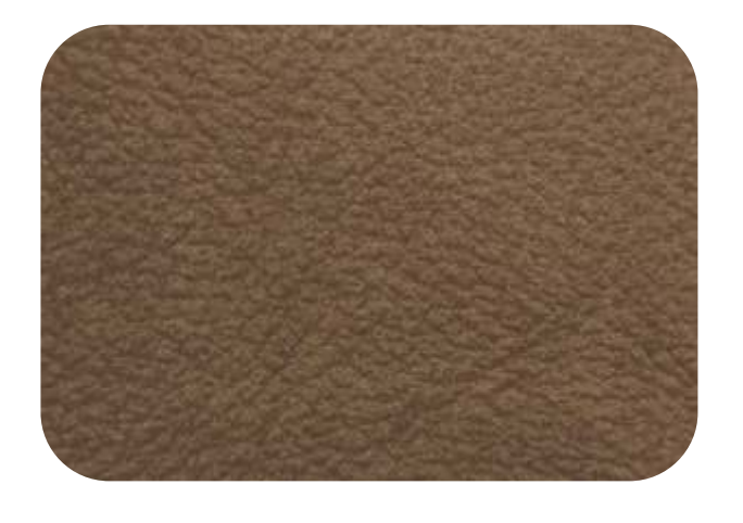
ANCONA - 905