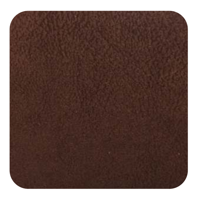
ANCONA - 911