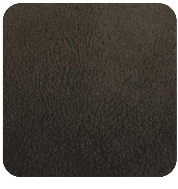
ANCONA - 919