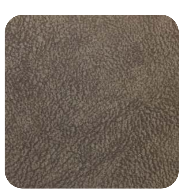
ANCONA - 917