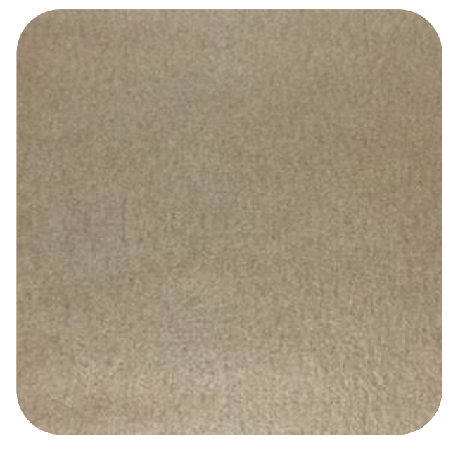
ANCONA - 901