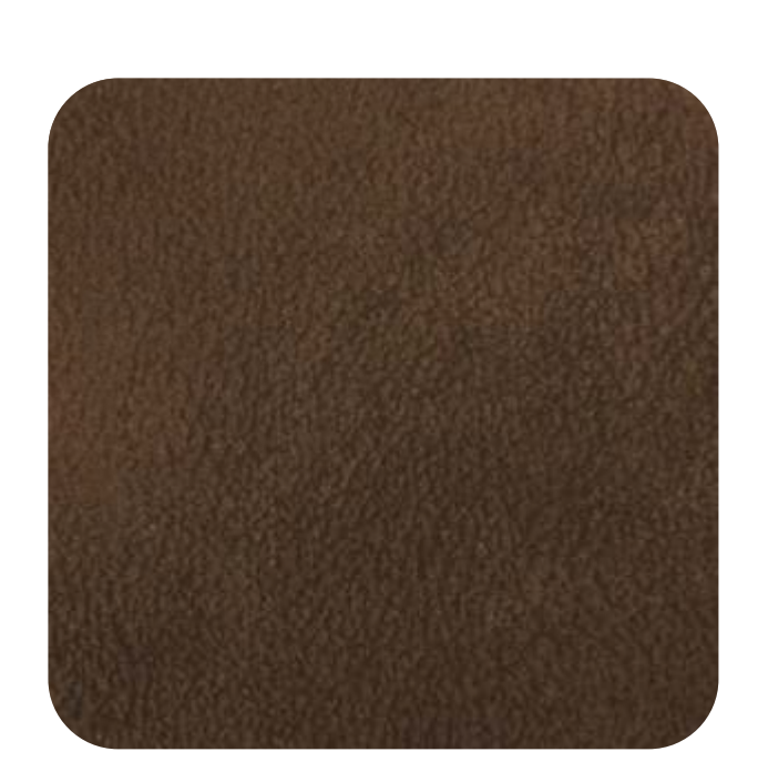
ANCONA - 907