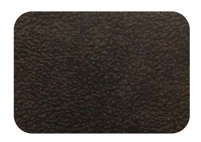
ANCONA - 909