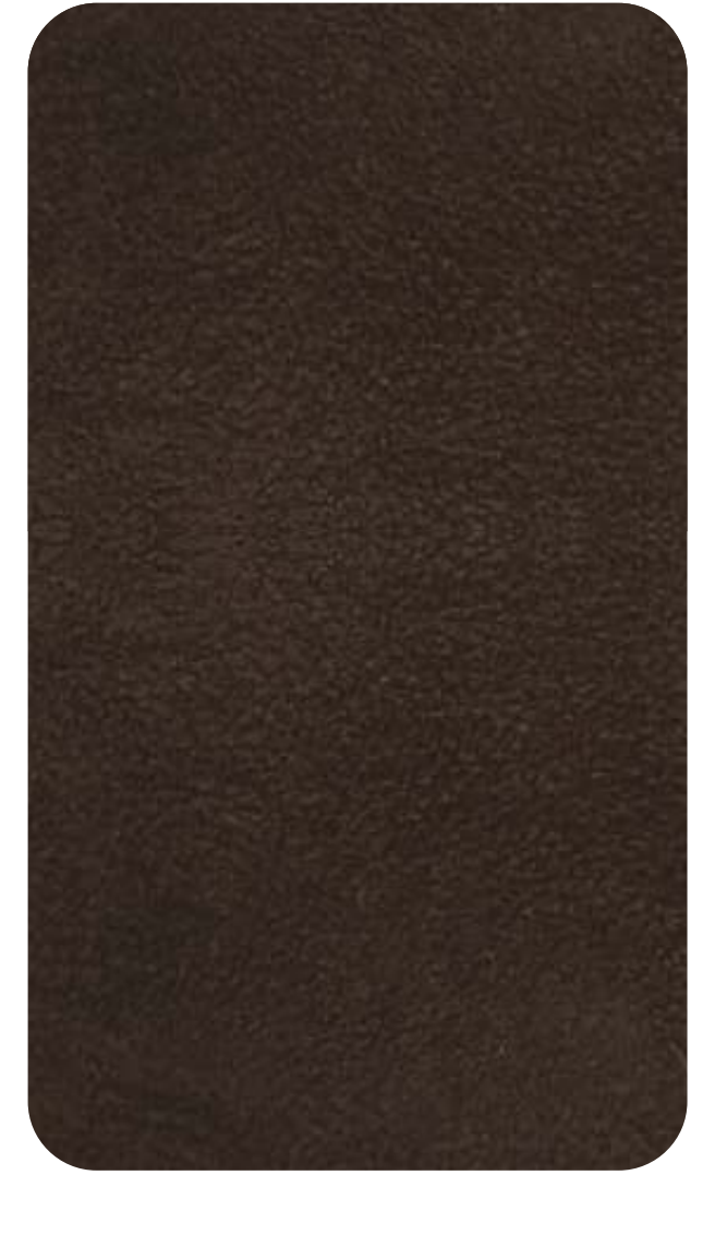
ANCONA - 908