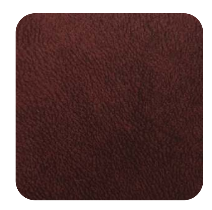
ANCONA - 912