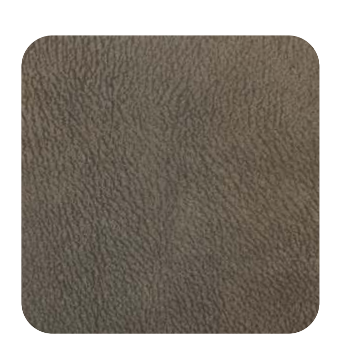
ANCONA - 916